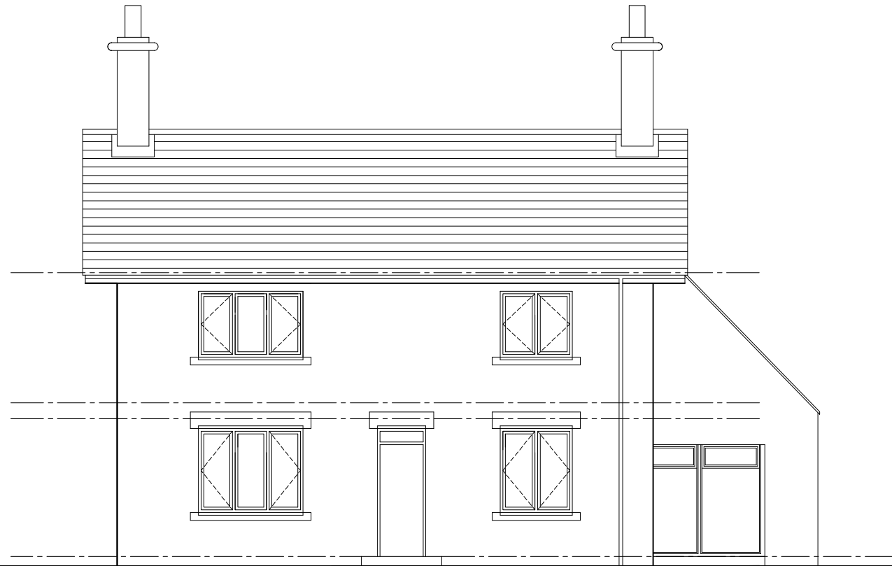
East facing elevation existing