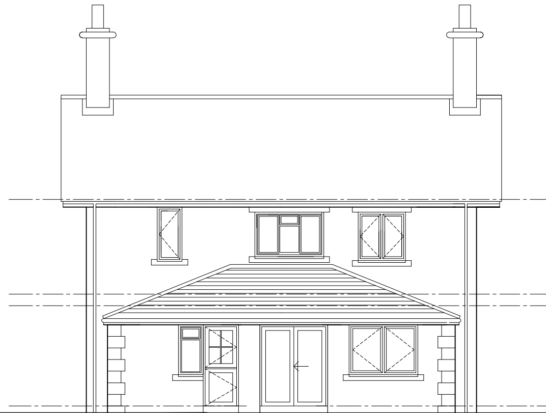
West facing elevation existing