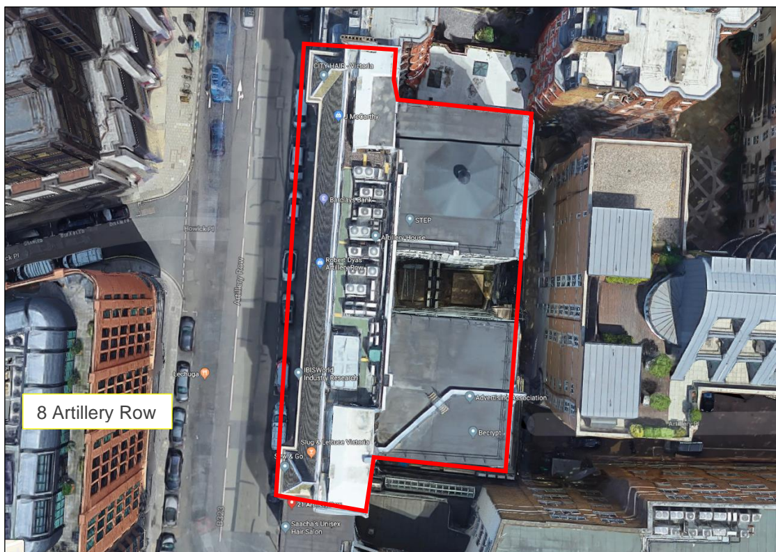
Site Plan (maps.google.co.uk)

The site is shown in the Site Plan below.