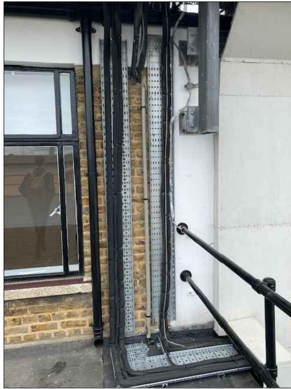
Image 1 Existing tray work to be used