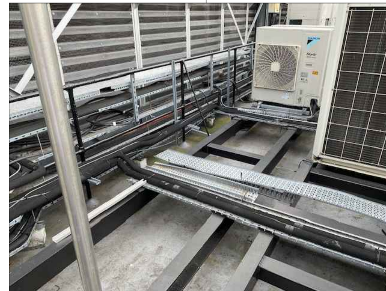
Image 2 Previously located plant areas

CONDENSERS TO BE REINSTATED IN EXISTING LOCATION CONNECTED FROM 7TH FLOOR USING EXISTING TRAY WORK CONDENSER SIZE: 950mm (W) X 943mm (H) x 355mm (D)