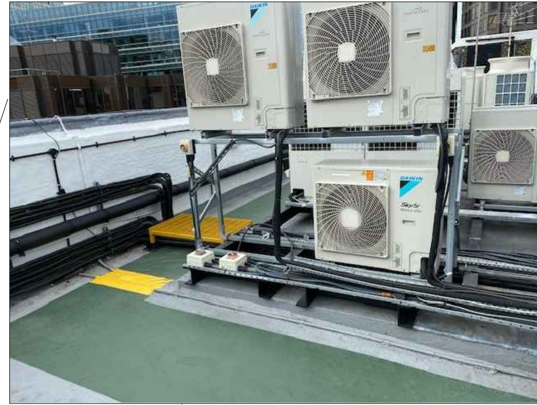
Image 2 Previously located plant areas