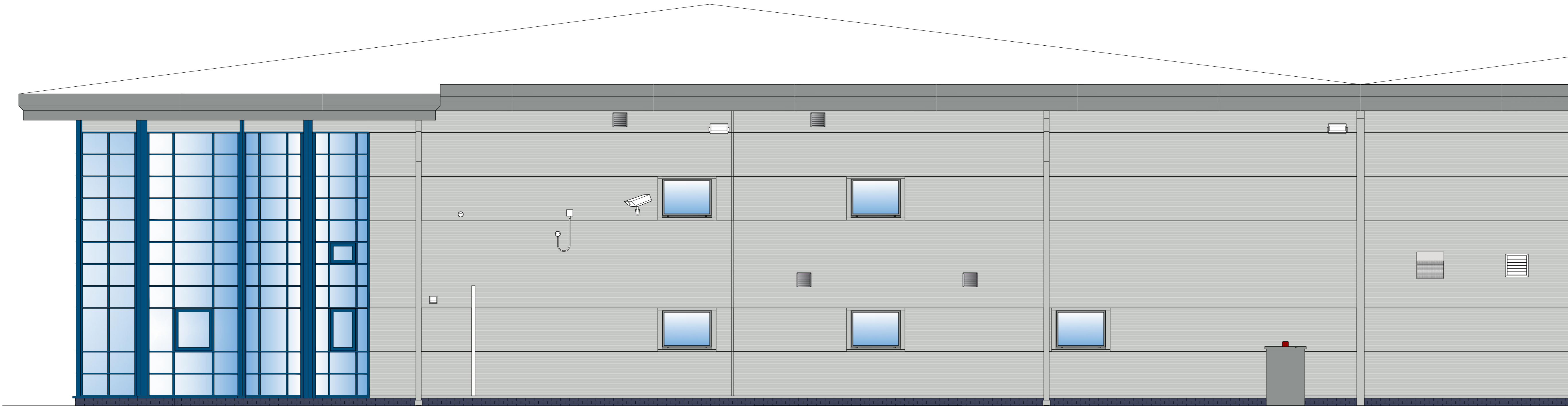
4 HAWTIN PARK-PROPOSED SOUTH ELEVATION scale 1:50

The content of this drawing is not to be reproduced or copied in whole or part without the written permission of Estilo Interior. Copyright © 2023. DO NOT SCALE FROM THIS DRAWING. All dimensions are to be verified on site and discrepancies are to be reported to Estilo Interior before proceeding with work. All work dimensions are approximate and can only be verified on a finished surface. Any discrepancy to be made at the time of construction. Always refer to the drawing for details and dimensions. All dimensions are approximate and can only be verified on a finished surface. NOTES: