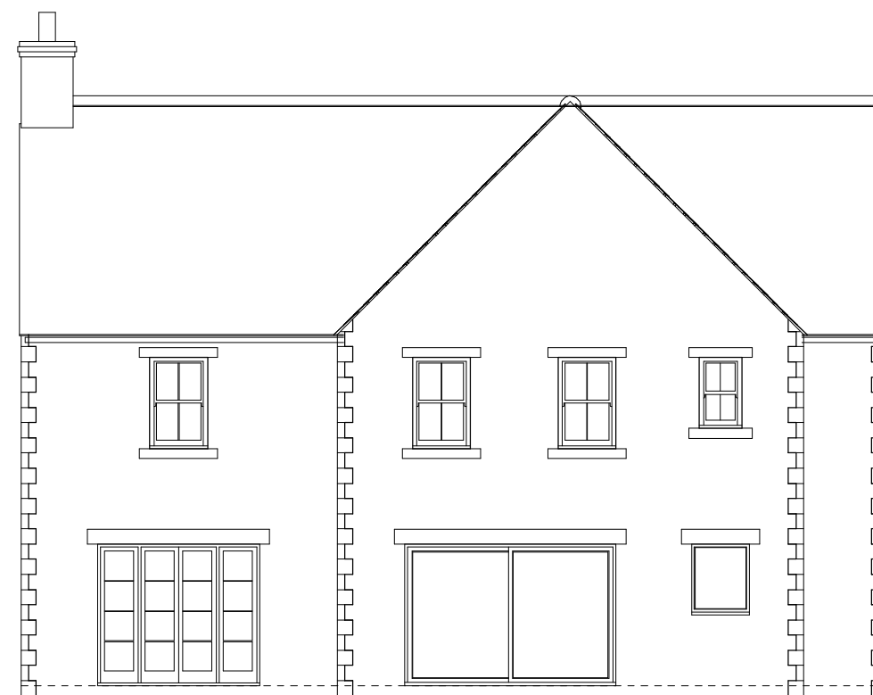
Rear Elevation 1-100