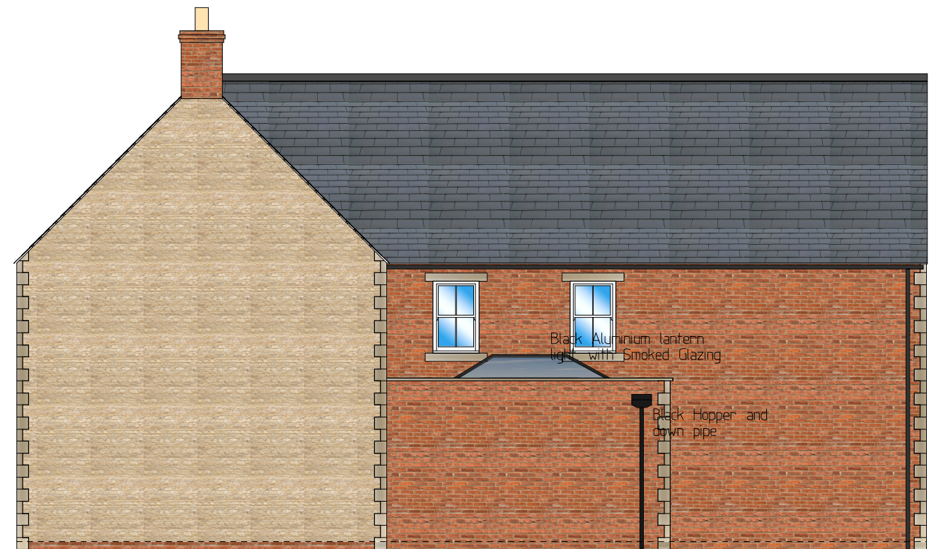
Side Elevation 1-100