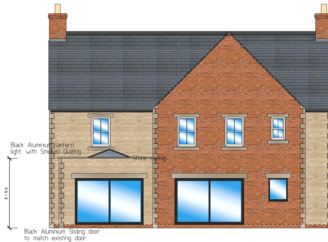
Rear Elevation 1-100

Rev A June 2021 Lantern Roof length increased to suit client instructions