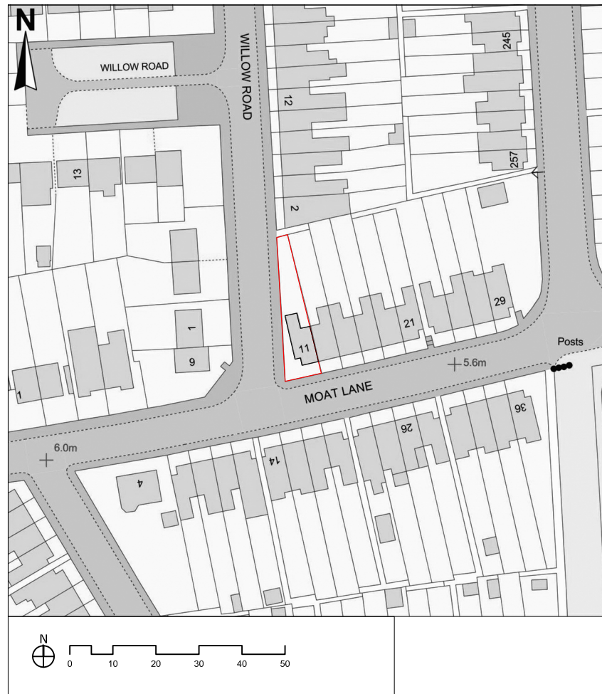
OS 01 Location Plan SCALE 1:1250 @A3