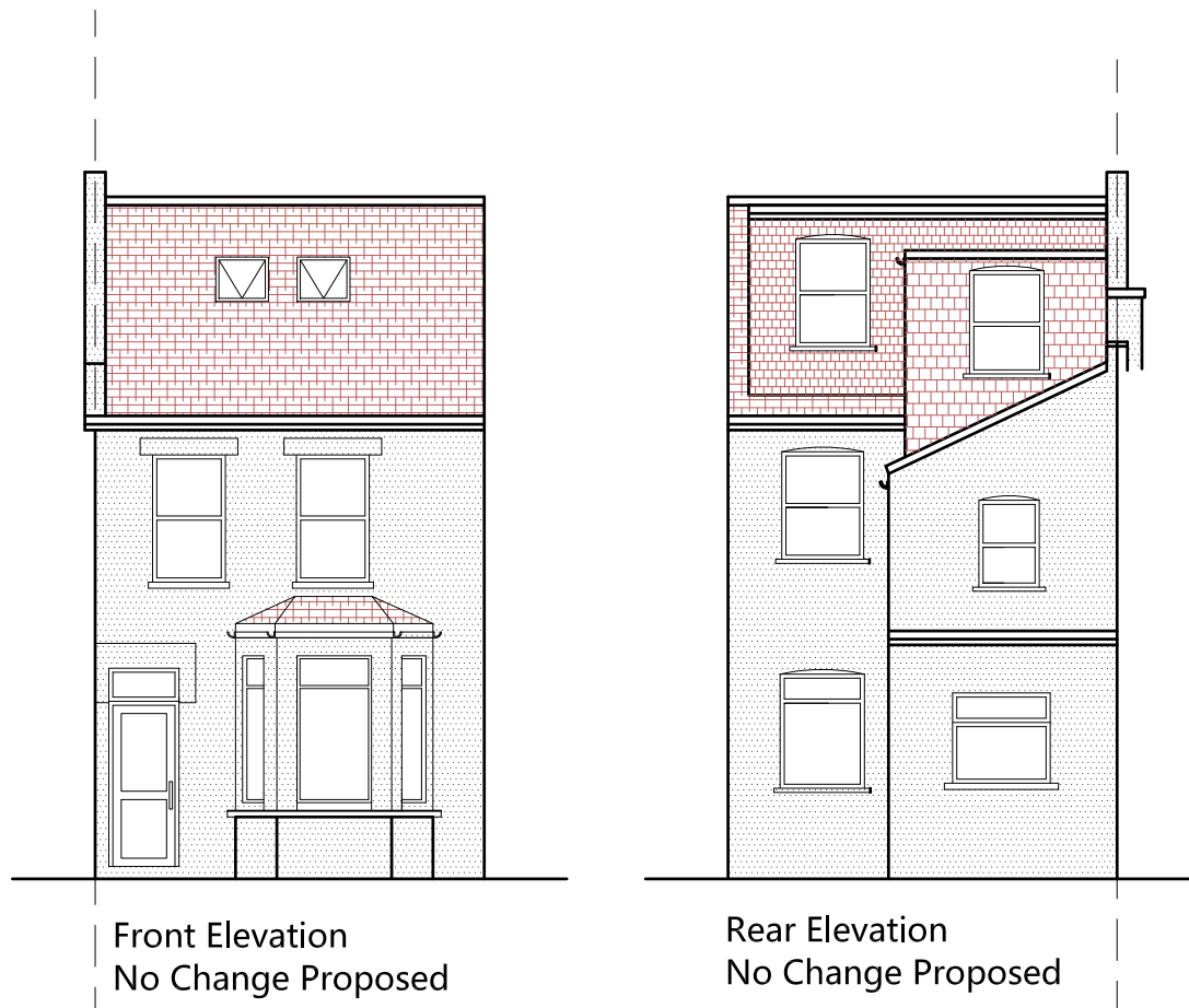
Front Elevation No Change Proposed