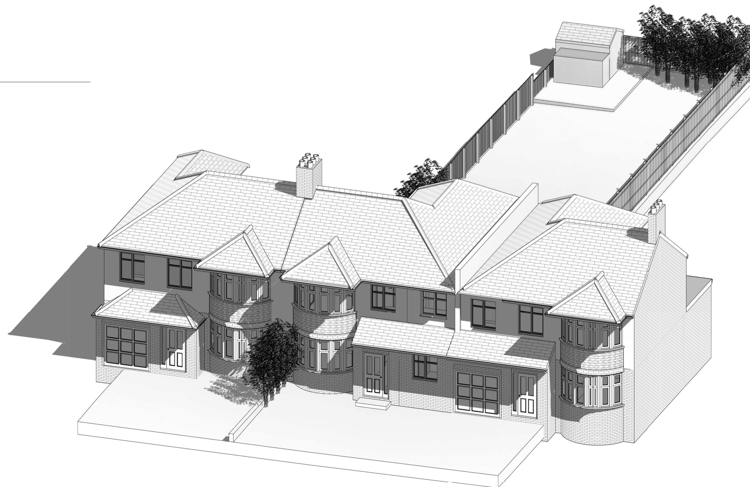
2 3D Proposed Front