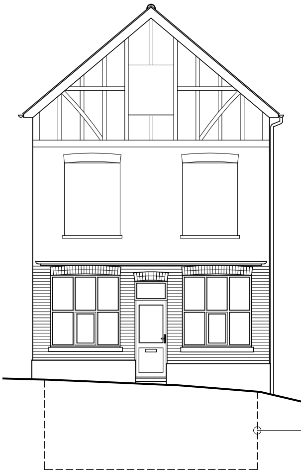
front (street) elevation remains as existing