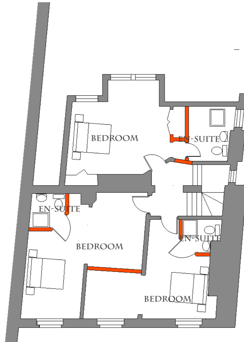
A Ground Floor 7 1:100