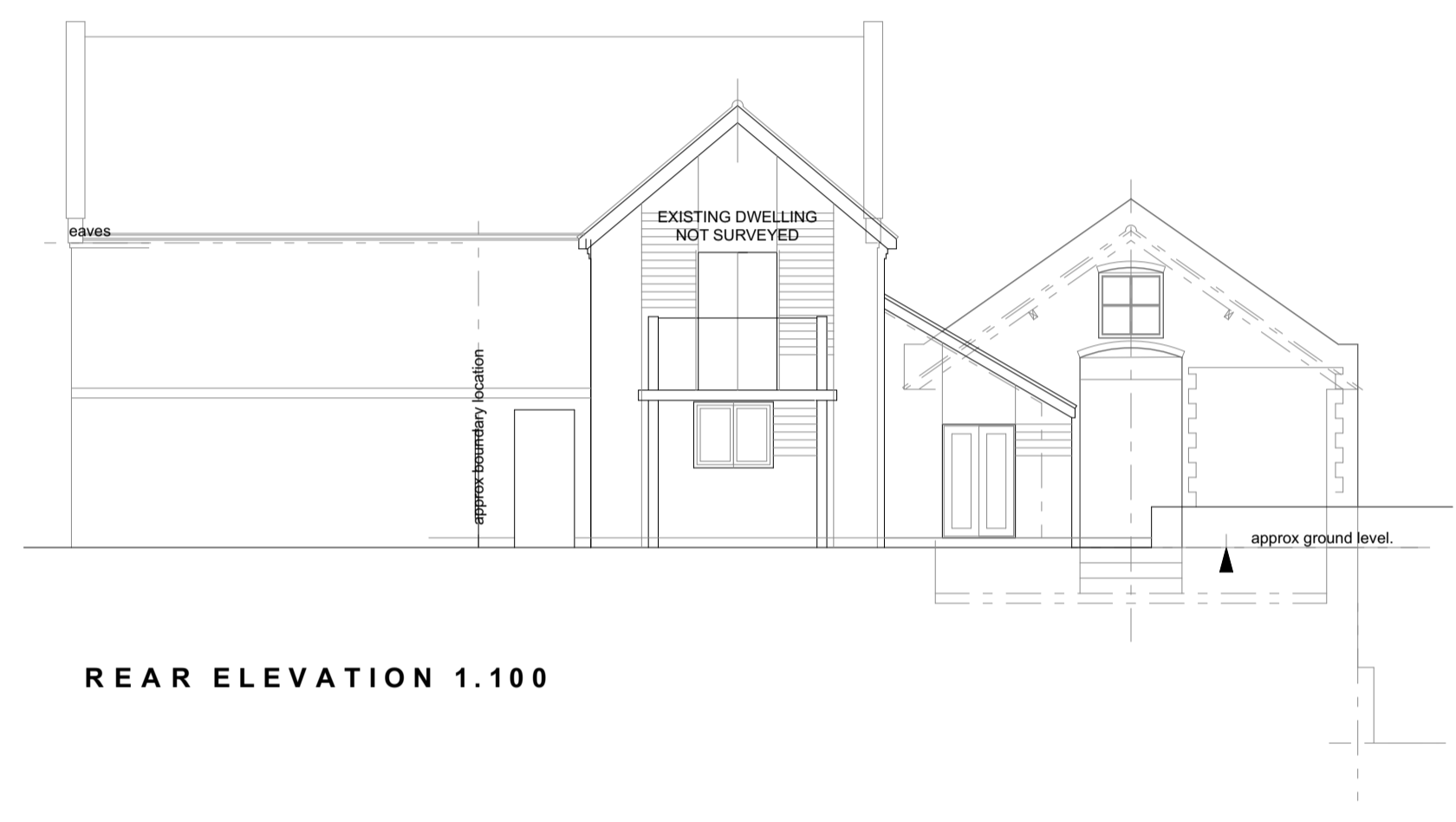
REAR ELEVATION 1.100