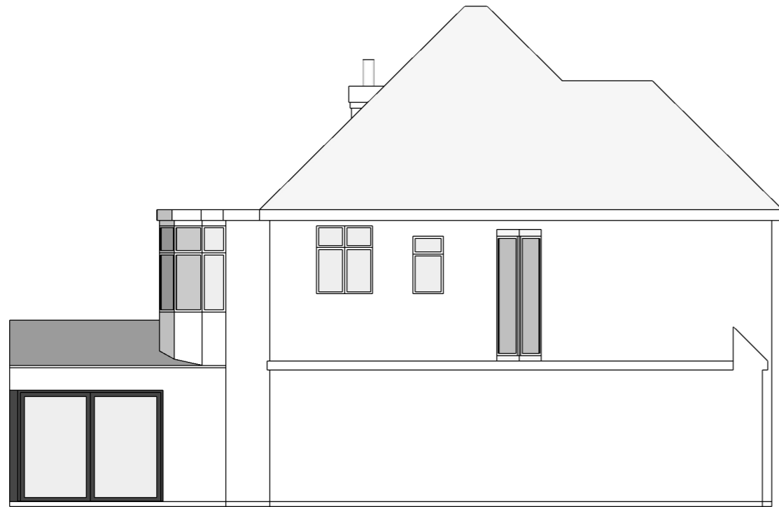
Proposed LHS Elevation 1:100@A3