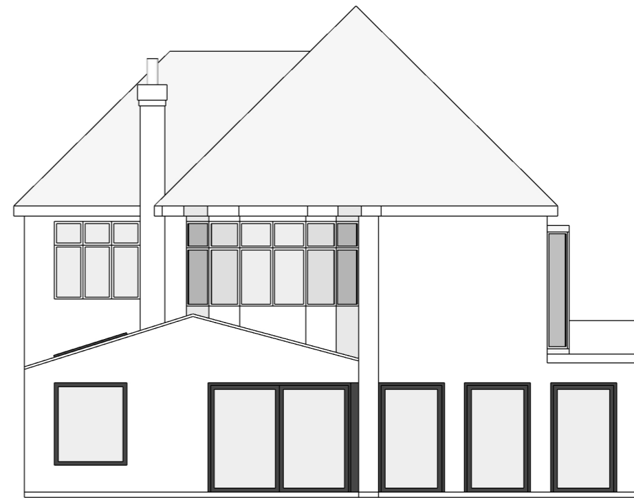
Proposed Rear Elevation 1:100@A3