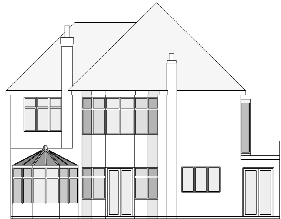
Existing Rear Elevation 1:100@A3