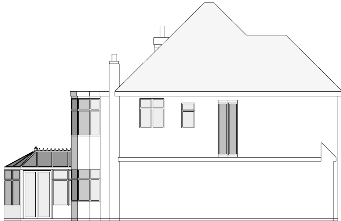
Existing LHS Elevation 1:100@A3