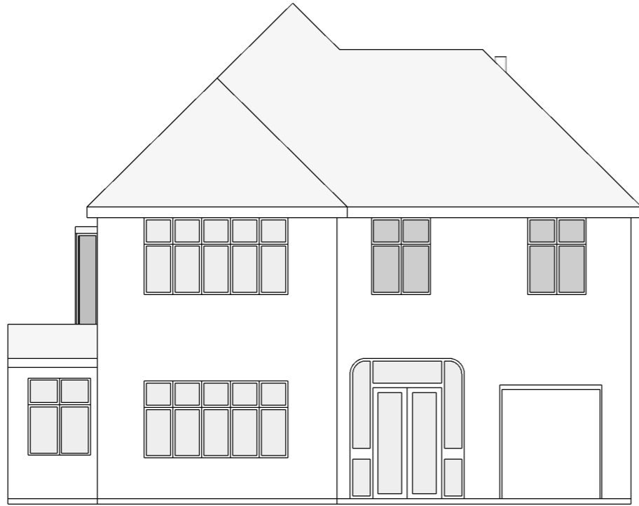
Existing Front Elevation 1:100@A3