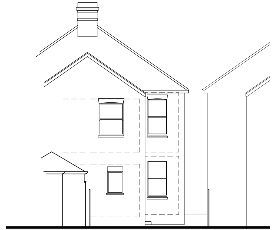
REAR ELEVATION - 1:100