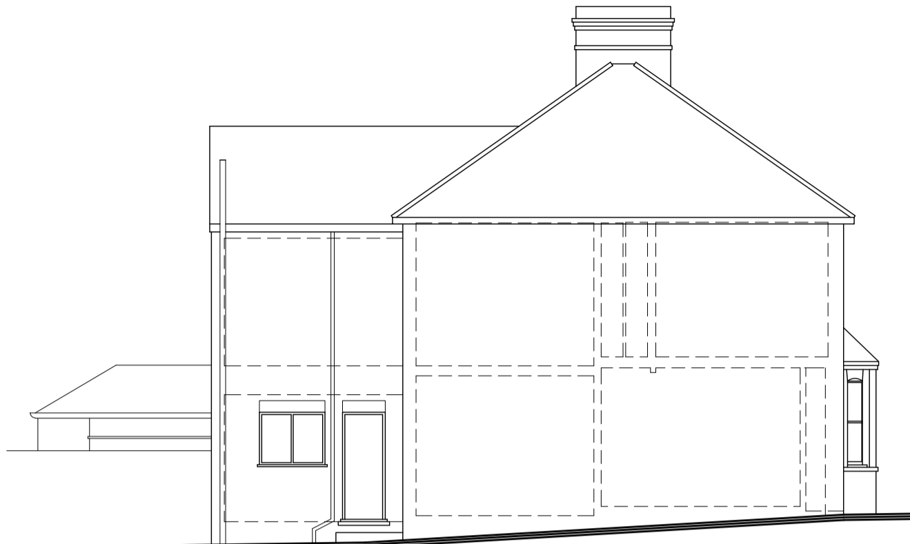
SIDE ELEVATION - 1:100