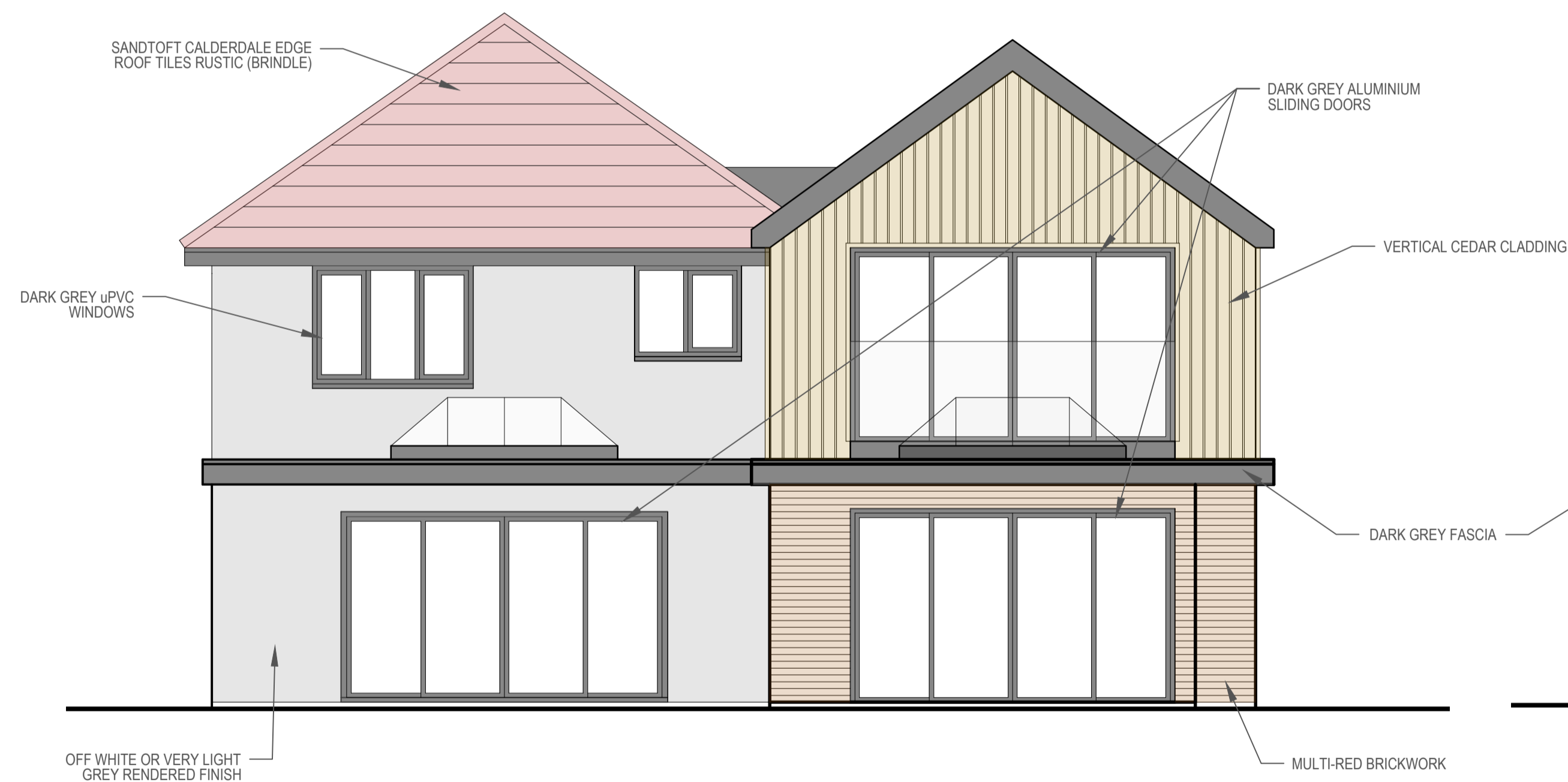
PROPOSED REAR ELEVATION SCALE 1:50 AT A1