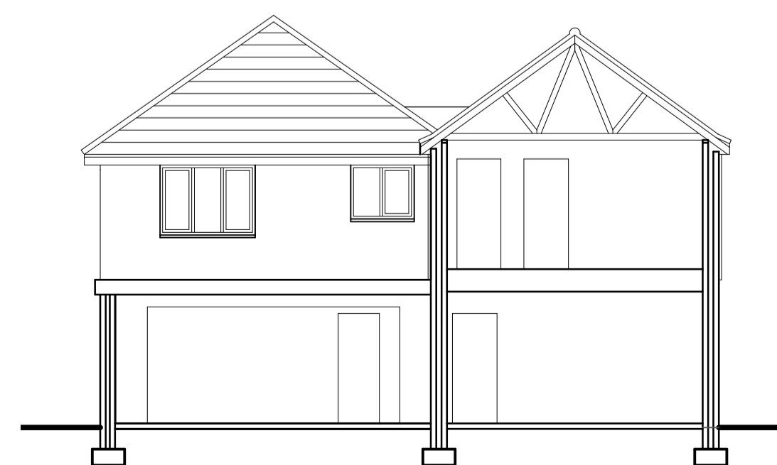
SECTION A-A SCALE 1:100 AT A1