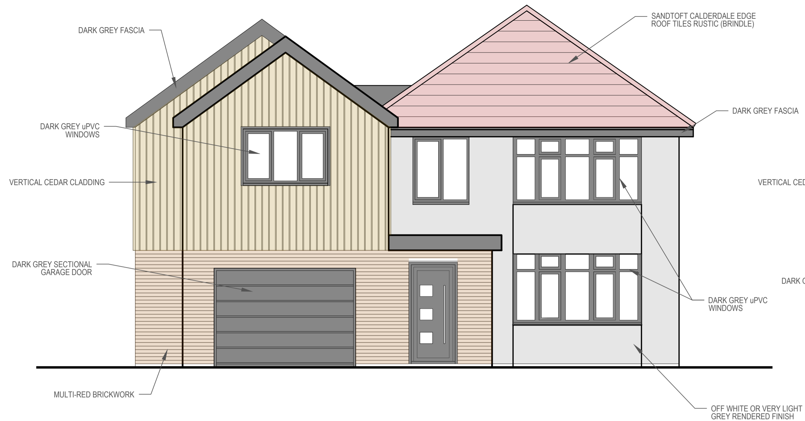
PROPOSED FRONT ELEVATION SCALE 1:50 AT A1