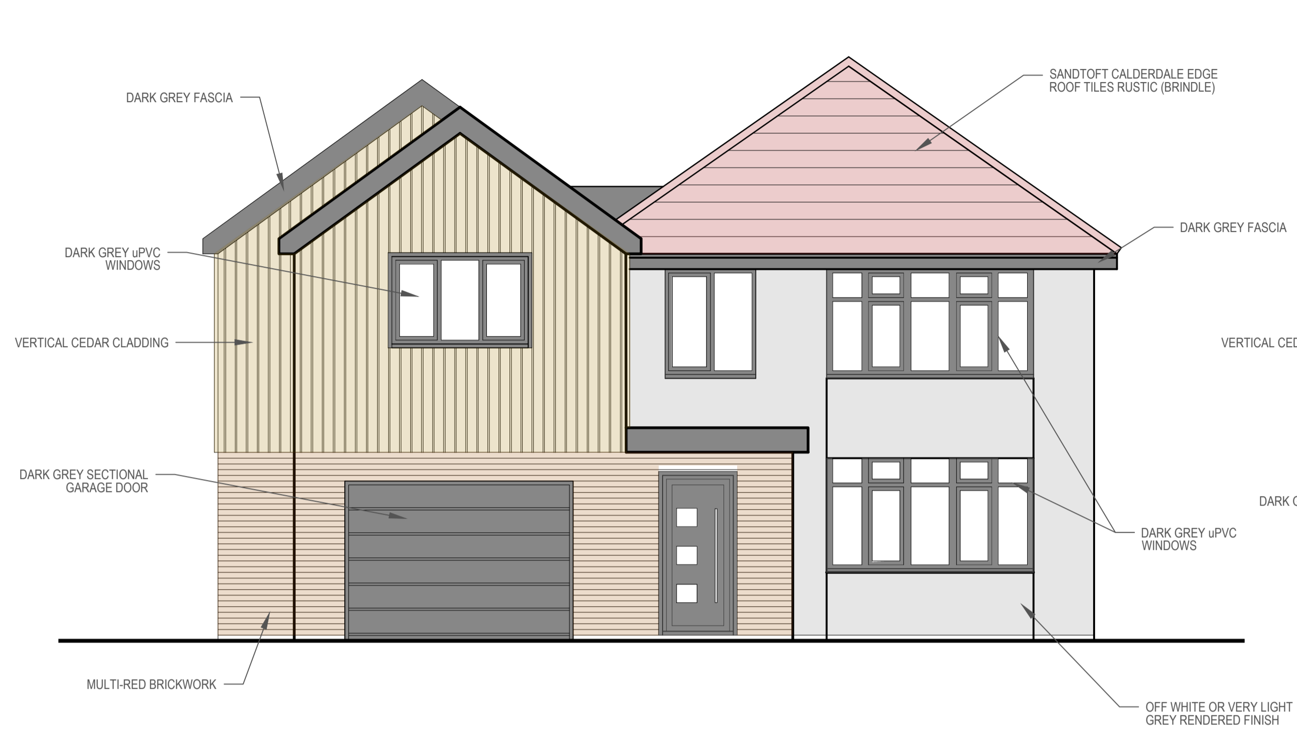
PROPOSED FRONT ELEVATION SCALE 1:50 AT A1