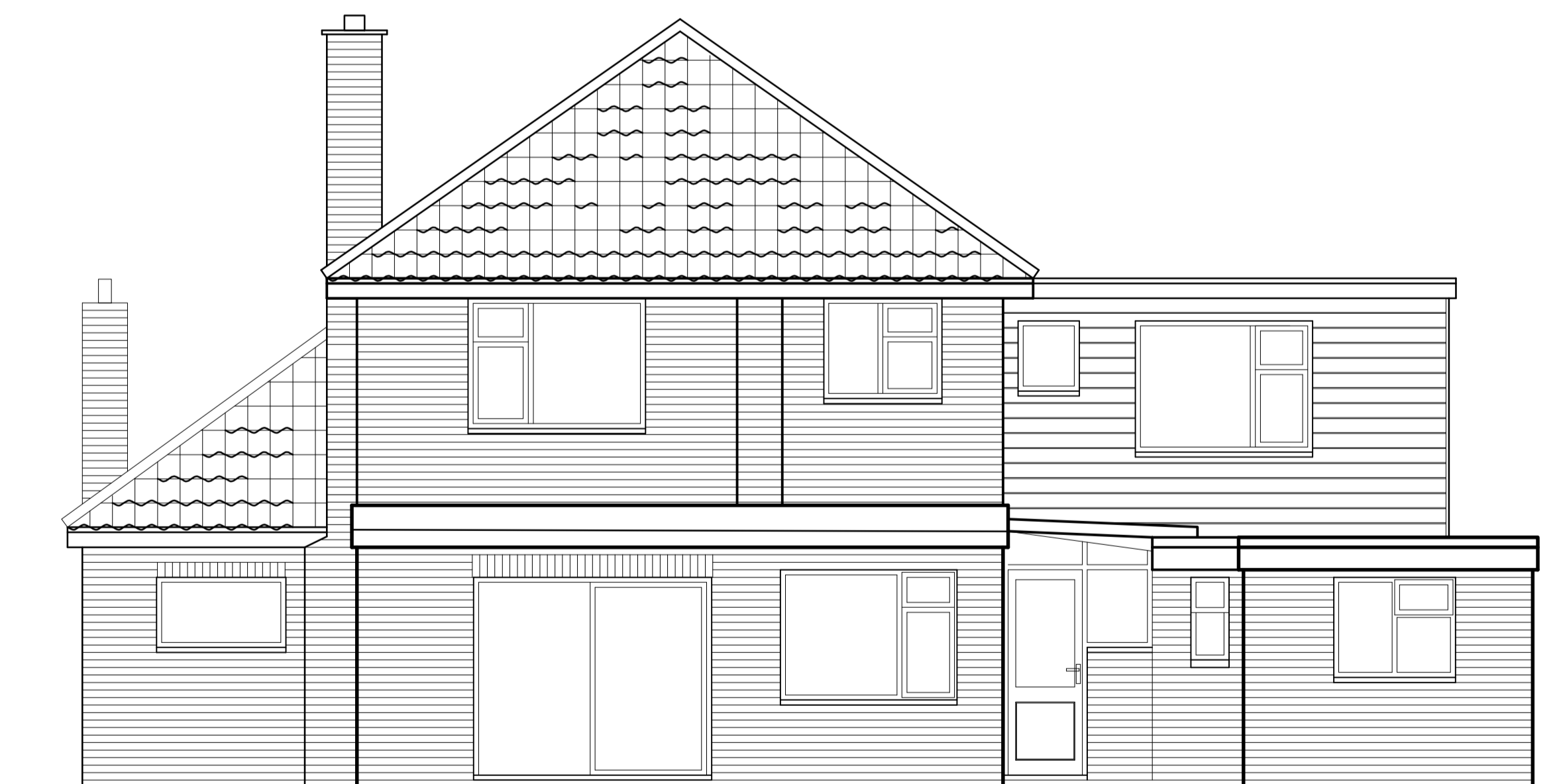
EXISTING REAR ELEVATION SCALE 1:50 AT A1