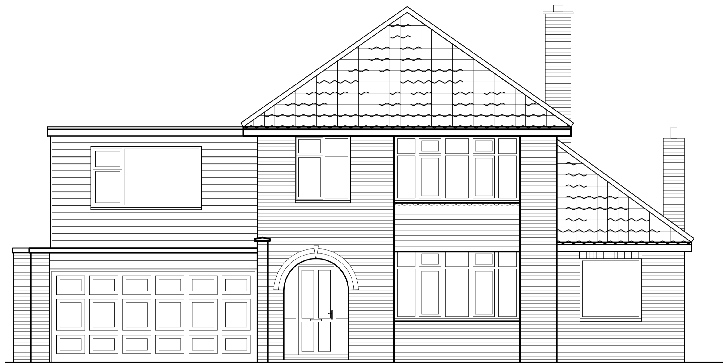
EXISTING FRONT ELEVATION SCALE 1:50 AT A1