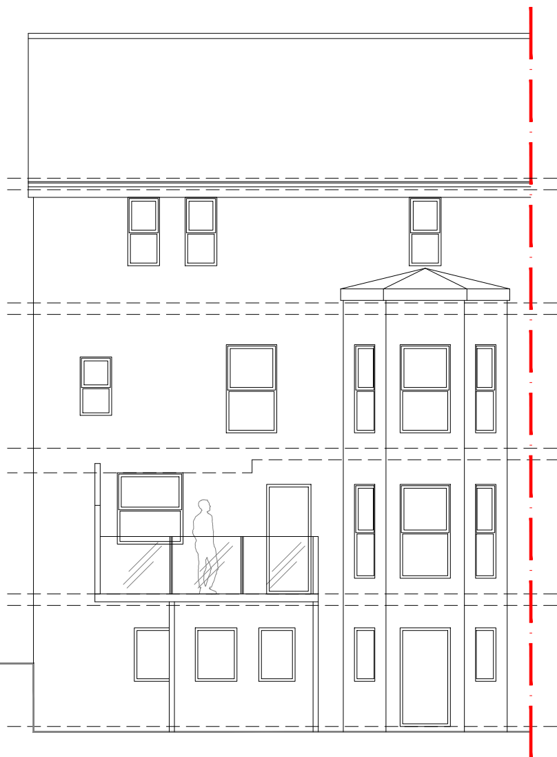
EXISTING REAR ELEVATION (1:100)

ALL DIMENSIONS ARE FOR REFERENCE PURPOSES ONLY DISCREPANCIES ARE TO BE REPORTED TO THE DRAWINGS AUTHOR. DO NOT SCALE FROM DRAWING.