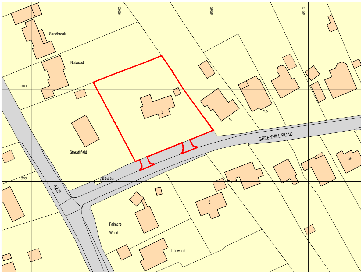
1 PLAN LOCATION PLAN