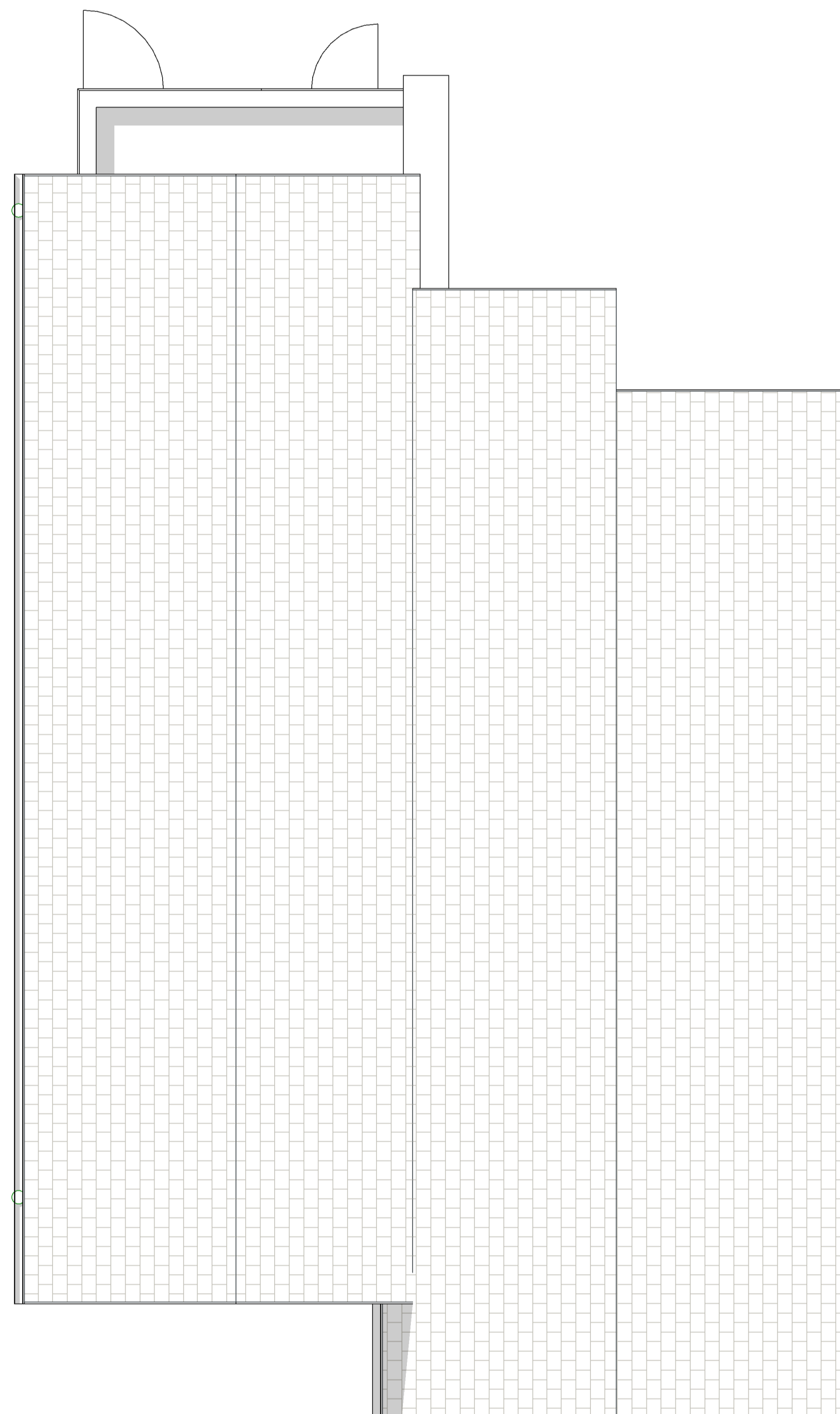
Roof Plan 1: 50 Scale