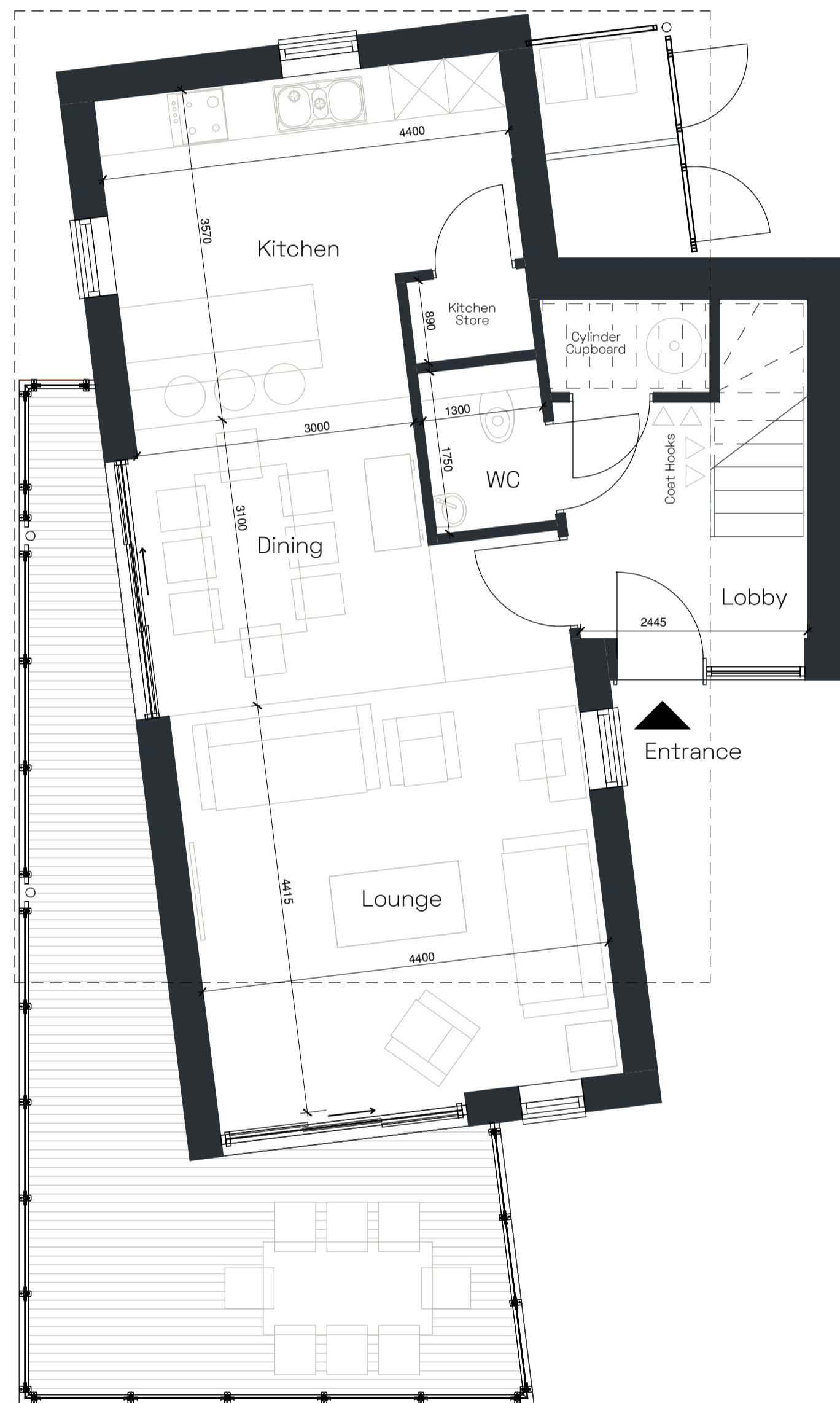
Ground Floor Plan 1:50 Scale

Notes This drawing may be scaled for the purposes of Planning Applications, Land Registry and for Legal plans where the scale bar is used, and where it verifies that the drawing is an original or an accurate copy; it may not be scaled for construction purposes. Always refer to figured dimensions. All dimensions are to be checked on site. Discrepancies and/or ambiguities between this drawing and information given elsewhere must be reported immediately to this office for clarification before proceeding. All drawings are to be read in conjunction with the specification and all works to be carried out in accordance with latest British Standards / Codes of Practice.