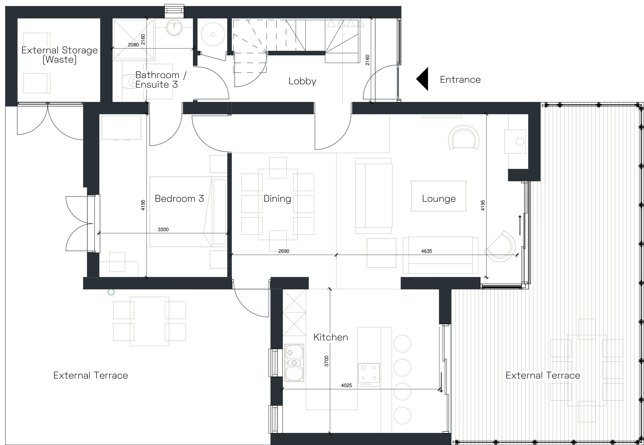
Ground Floor Plan 1:50 Scale

Notes This drawing may be scaled for the purposes of Planning Applications. Land Registry and for Legal plans where the scale bar is used, and where it verifies that the drawing is an original or an accurate copy. It may not be scaled for construction purposes. Always refer to signed dimensions. All dimensions are to be checked on site. Discrepancies and/or ambiguities between this drawing and information given elsewhere must be reported immediately to this office for clarification before proceeding. All drawings are to be read in conjunction with the specification and all works to be carried out in accordance with latest British Standards / Codes of Practice.