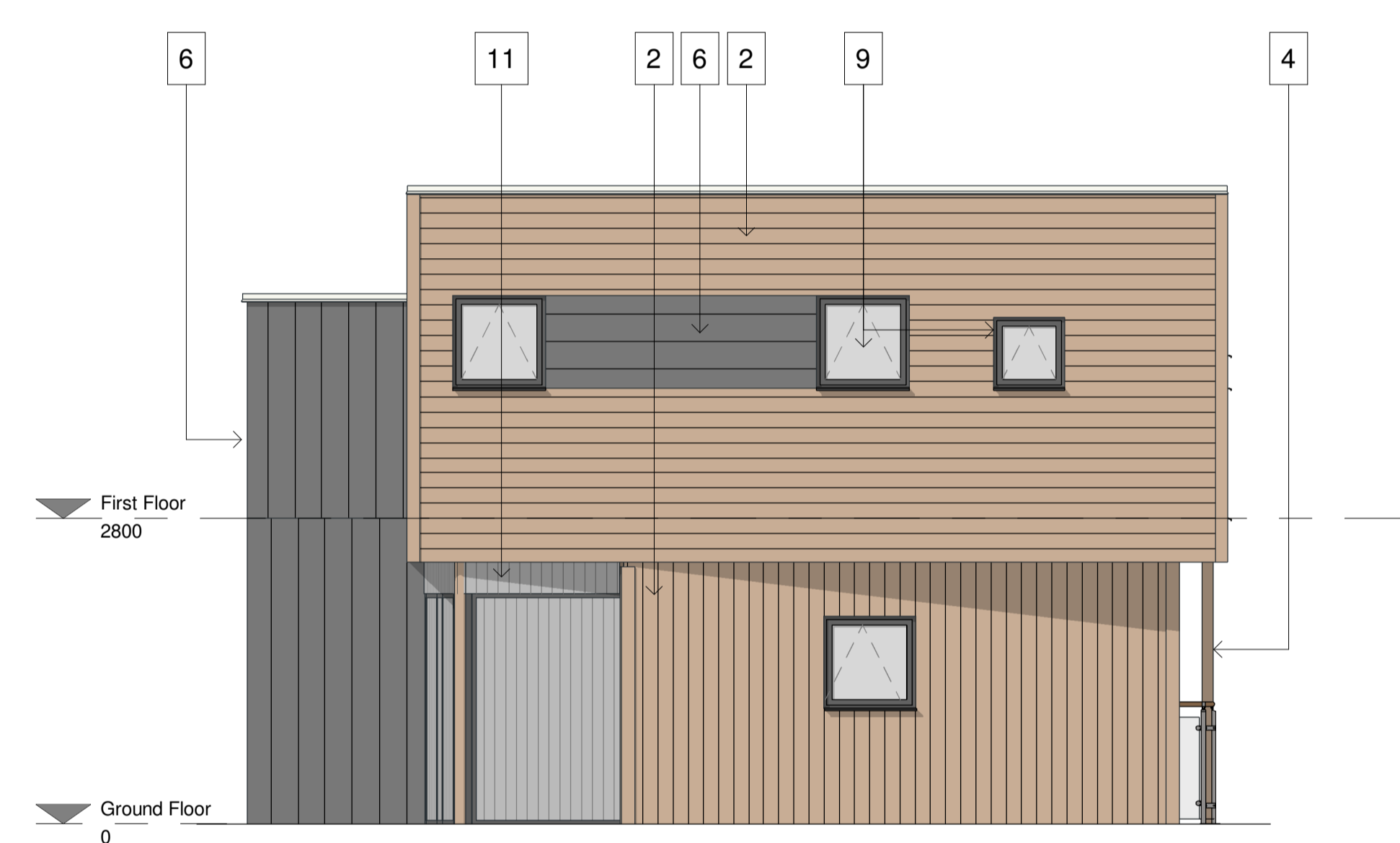
Rear Elevation - (including external stores, kitchen window and windows to bedroom three) 1: 50 Scale