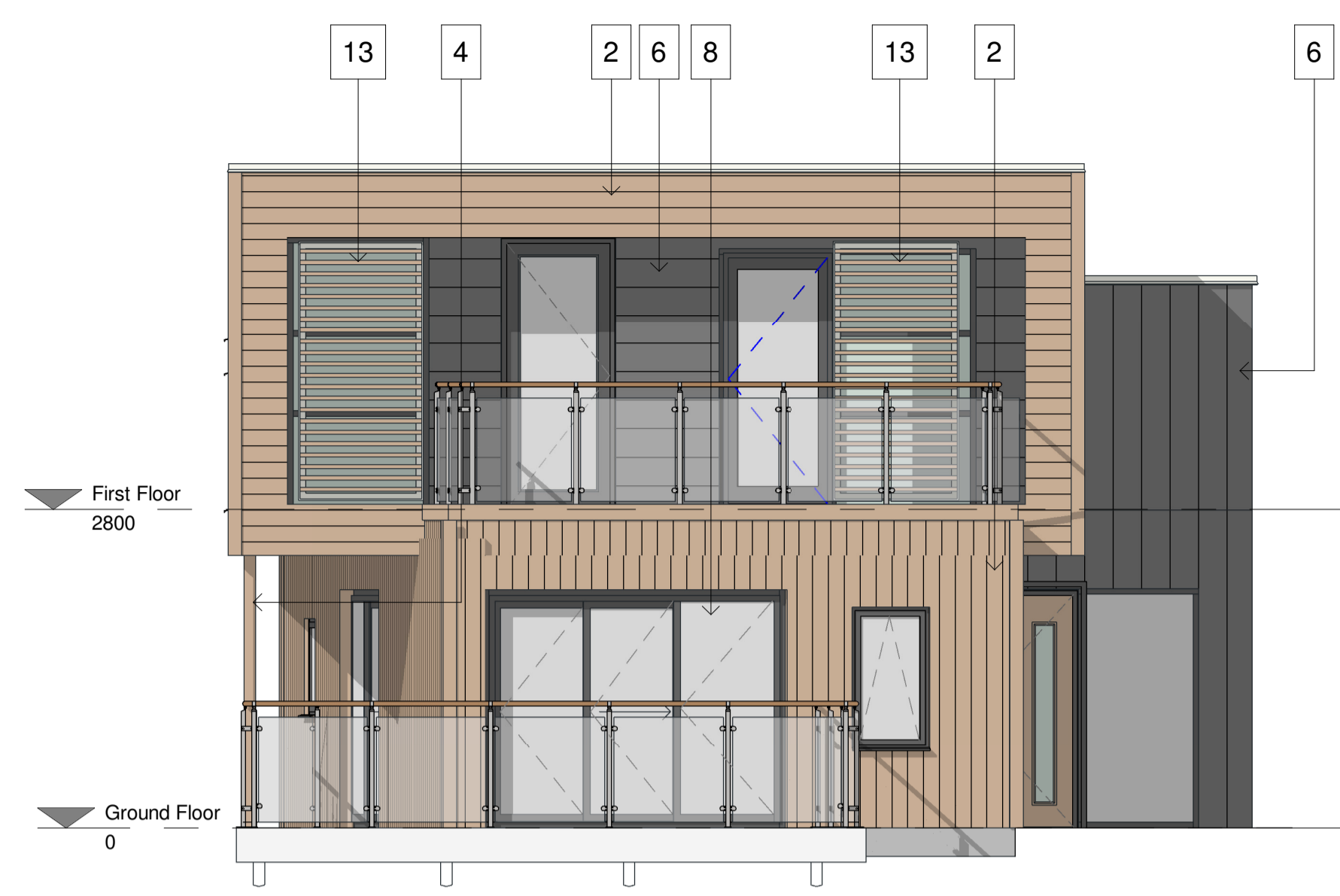
Principal Elevation - (including external terraces, glazed screens to master bedroom/lounge) 1: 50 Scale

Notes This drawing may be scaled for the purposes of Planning Applications, Land Registry and for Legal plans where the scale bar is used, and where it verifies that the drawing is an original or an accurate copy. It may not be scaled for construction purposes. Always refer to signed dimensions. All dimensions are to be checked on site. Discrepancies and/or ambiguities between this drawing and information given elsewhere must be reported immediately to this office for clarification before proceeding. All drawings are to be read in conjunction with the specification and all works to be carried out in accordance with latest British Standards / Codes of Practice.