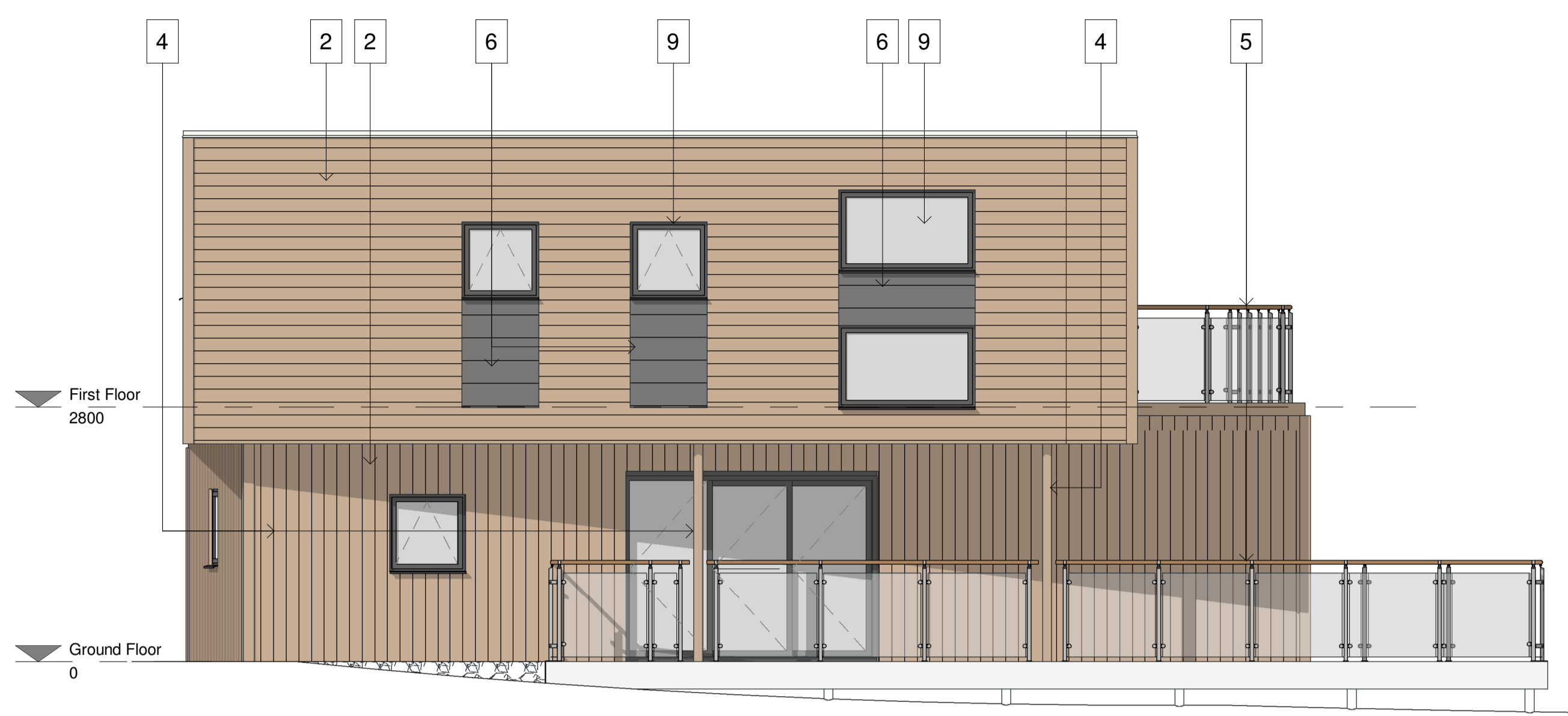
Side Elevation - (elevation including bifold doors adjacent to dining area, punch hole windows serving master bedroom) 1: 50 Scale