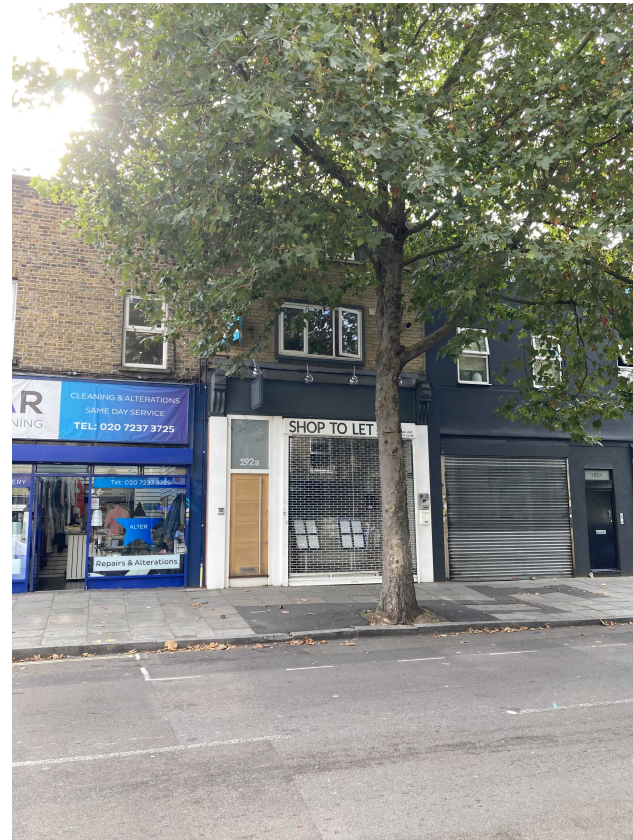
Photographs of existing building