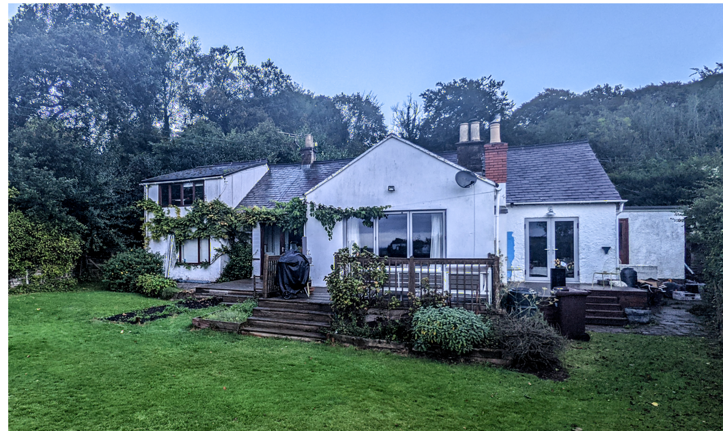
Existing South Facing Elevation