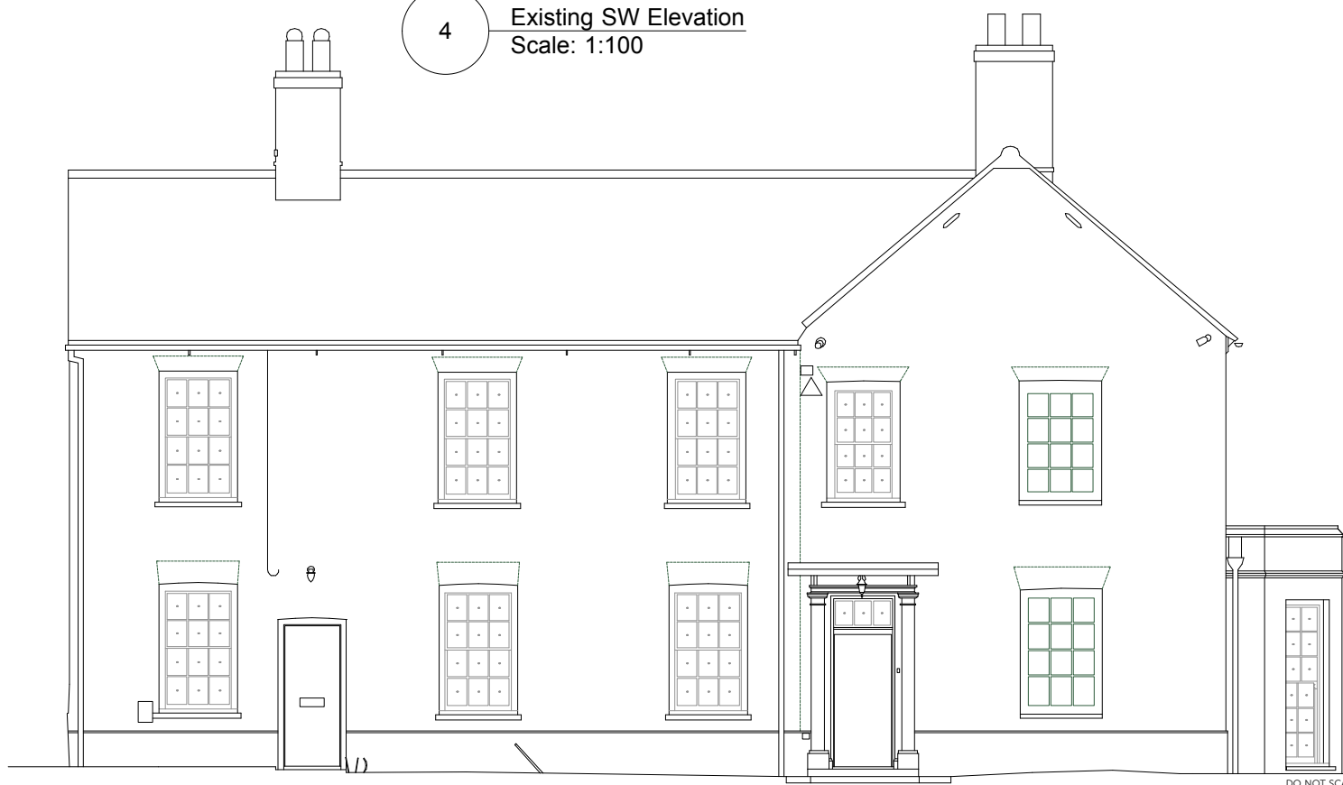
1 Existing SE Elevation Scale: 1:100

DO NOT SCALE FROM THIS DRAWING AND CHECK ALL DIMENSIONS ON SITE THIS DRAWING IS TO BE READ IN CONJUNCTION WITH ALL OTHER RELEVANT INFORMATION FROM OTHER CONSULTANTS