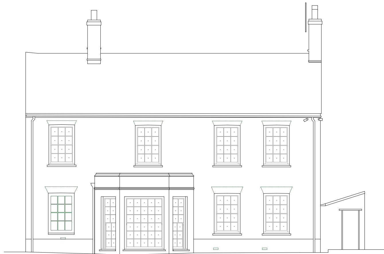
4 Existing SW Elevation Scale: 1:100