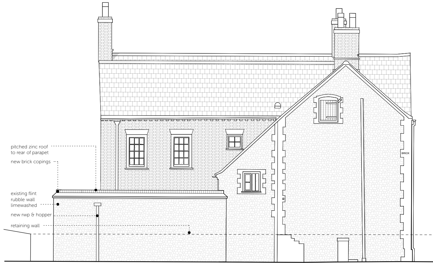
3 NW Elevation Scale: 1:100