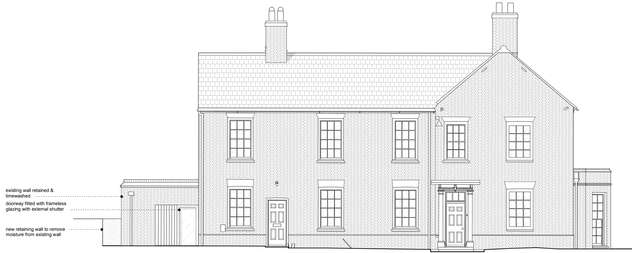
3 South West Elevation Scale: 1:100