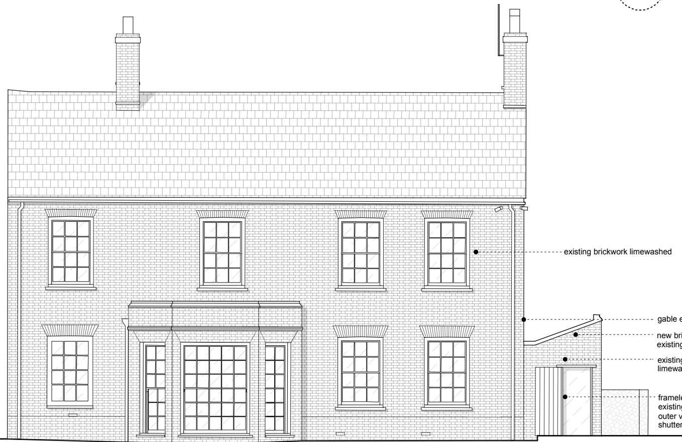
1 South East Elevation Scale: 1:100

existing brickwork limewashed gable end of new zinc roof new brick coping to existing wall existing brickwork limewashed frameless glazing to existing doorway outer vertically boarded shutter