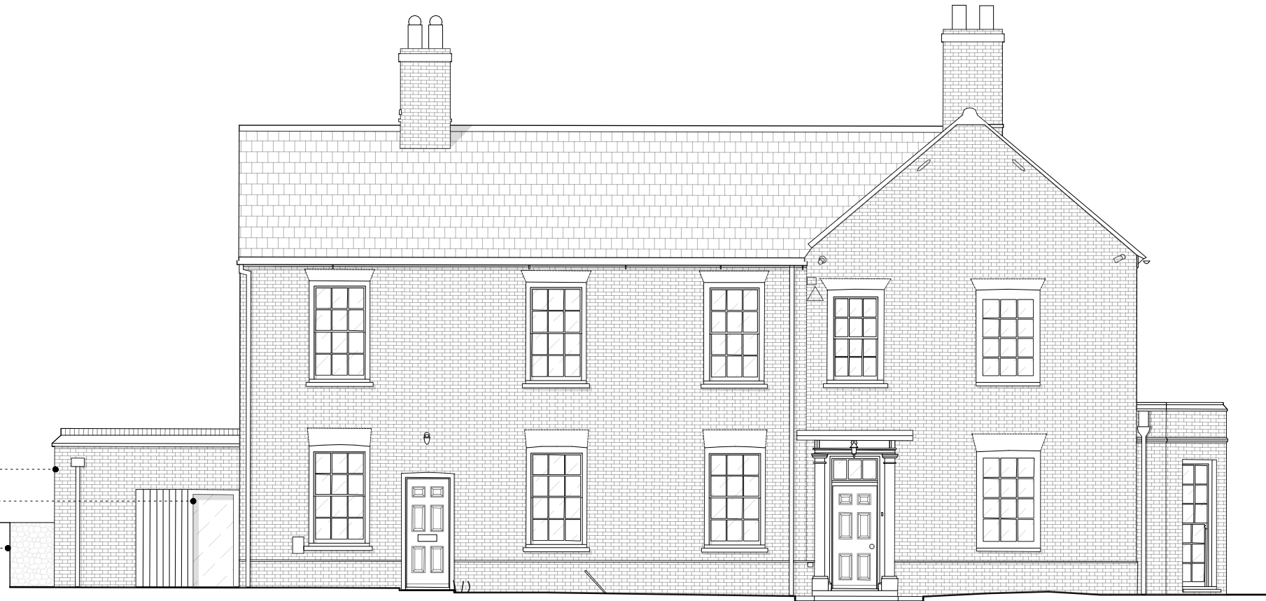
3 South West Elevation Scale: 1:100

existing wall retained & limewashed doorway fitted with frameless glazing with external shutter new retaining wall to remove moisture from existing wall