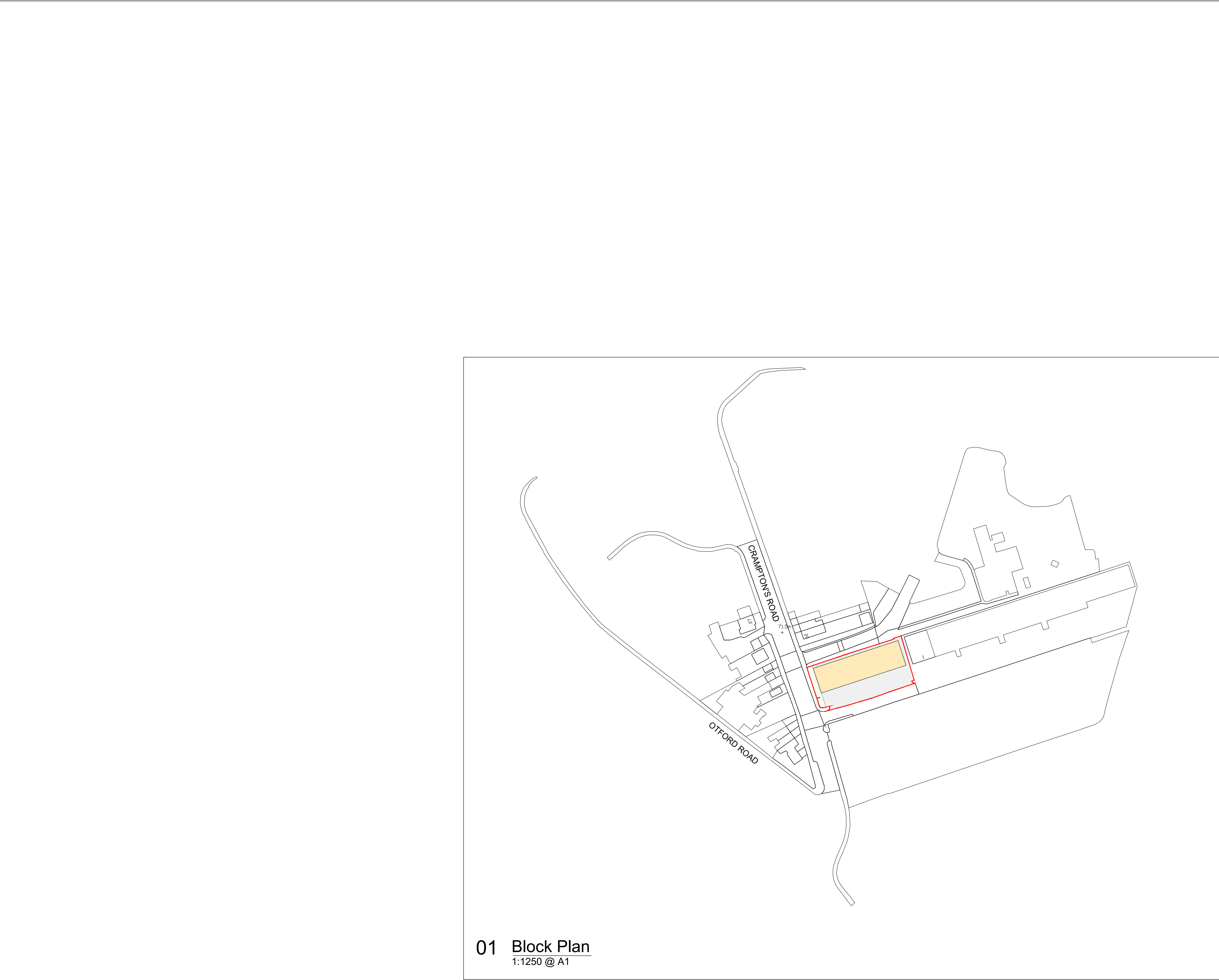
01 Block Plan 1:1250 @ A1