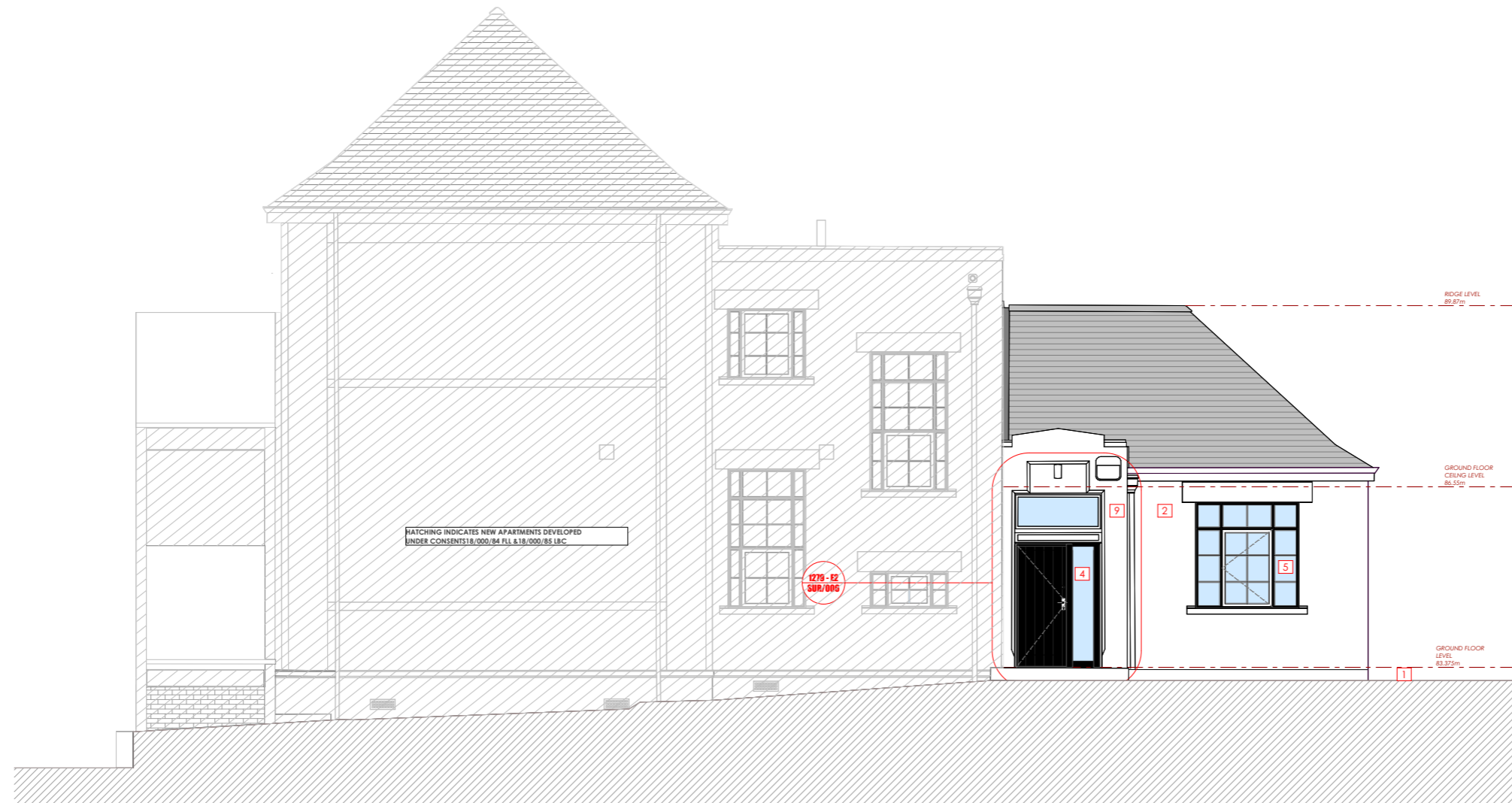
EXISTING NORTH EAST ELEVATION