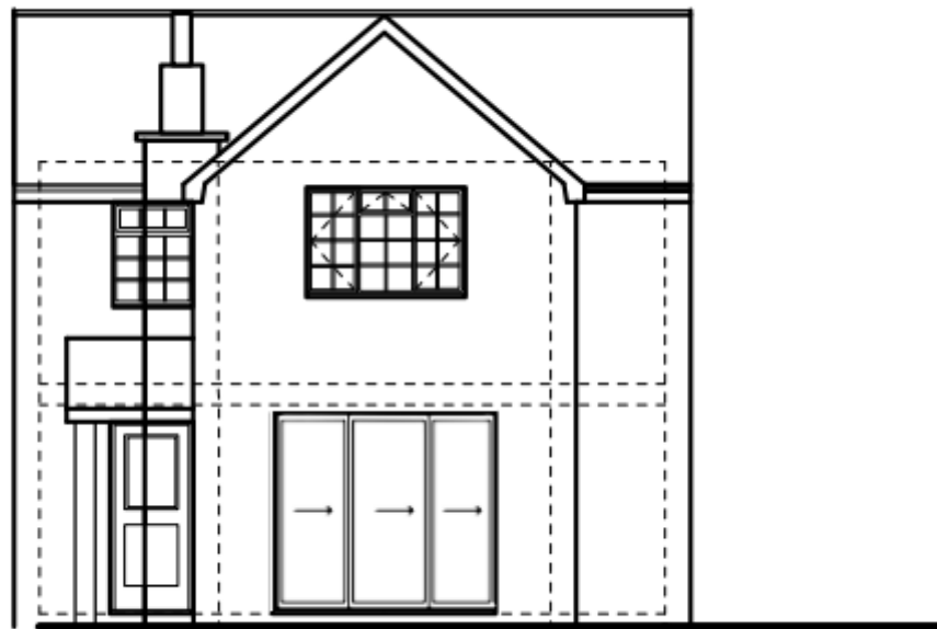
REAR ELEVATION - east