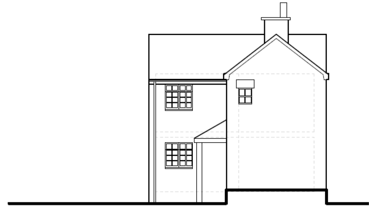
FRONT ELEVATION - west