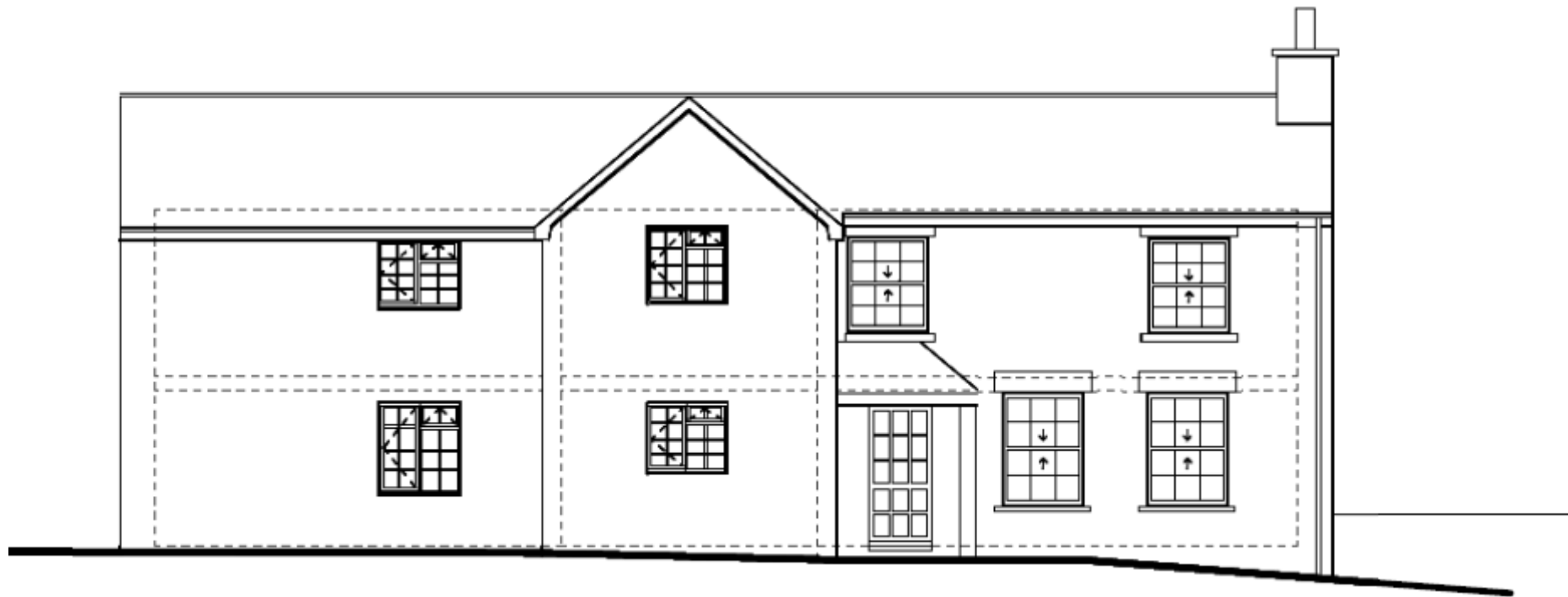
SIDE ELEVATION - north