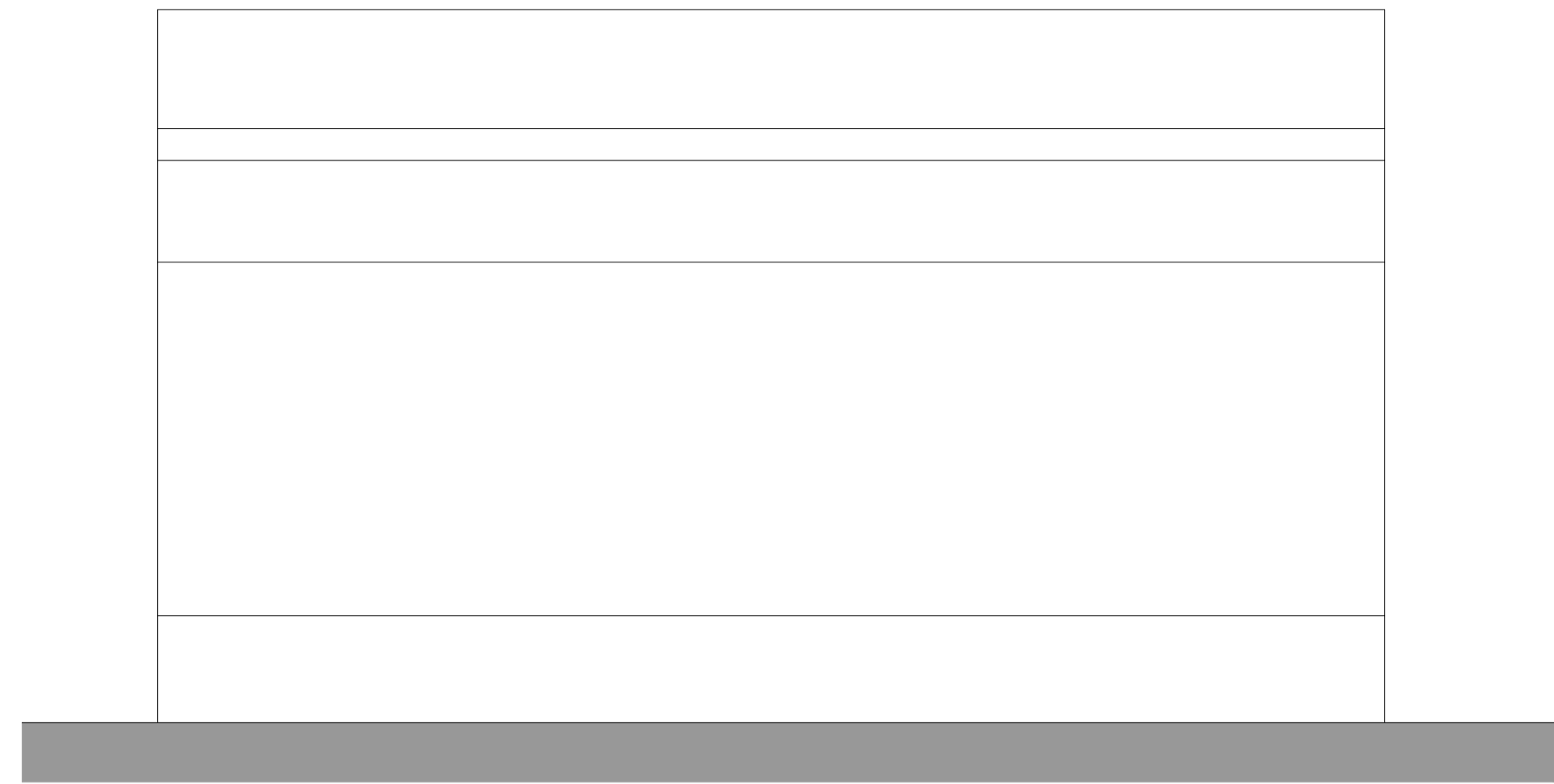
EXISTING EAST AND WEST ELEVATIONS