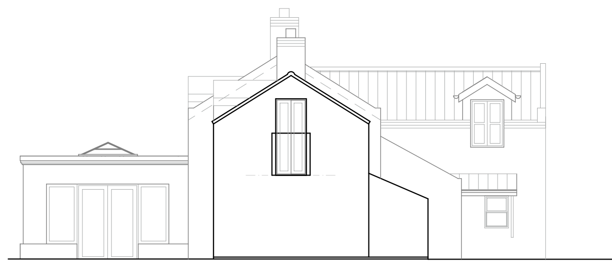
Front Elevation - East scale - 1:100