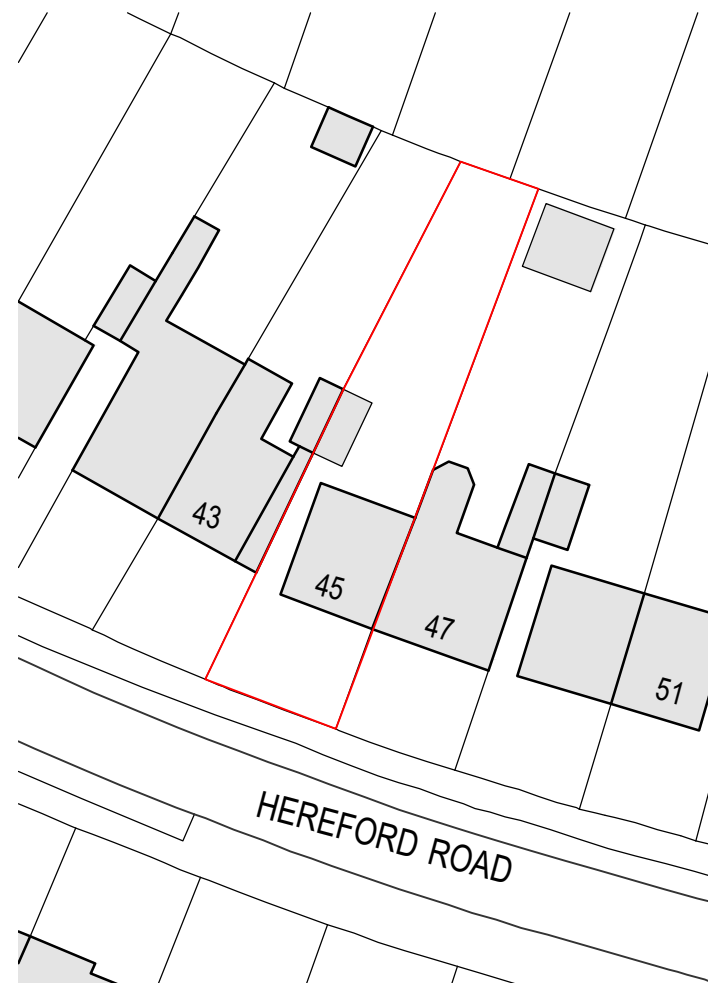
01 Existing Block Plan 1:500