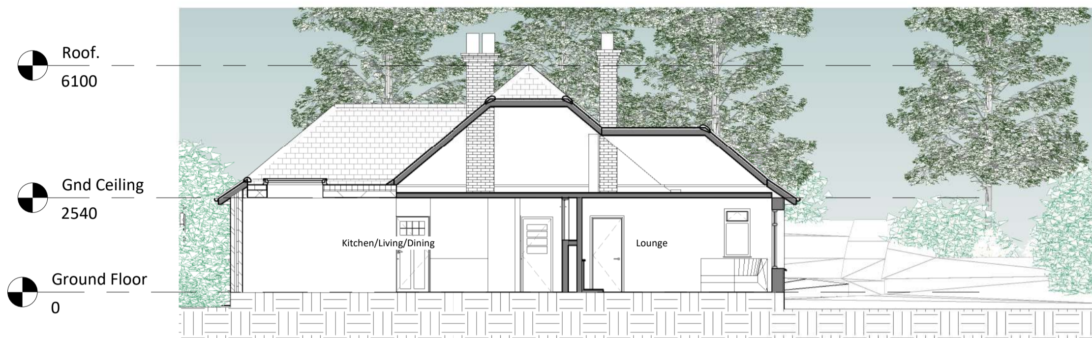
1 Proposed Section 2 1 : 100