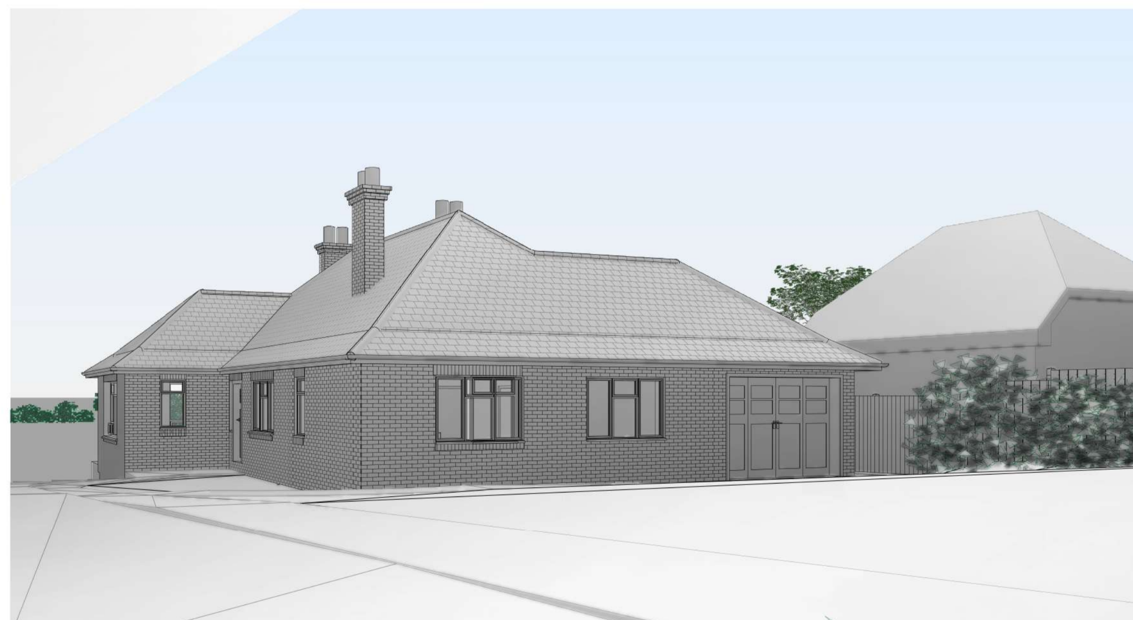
3 Proposed Front Perspective View