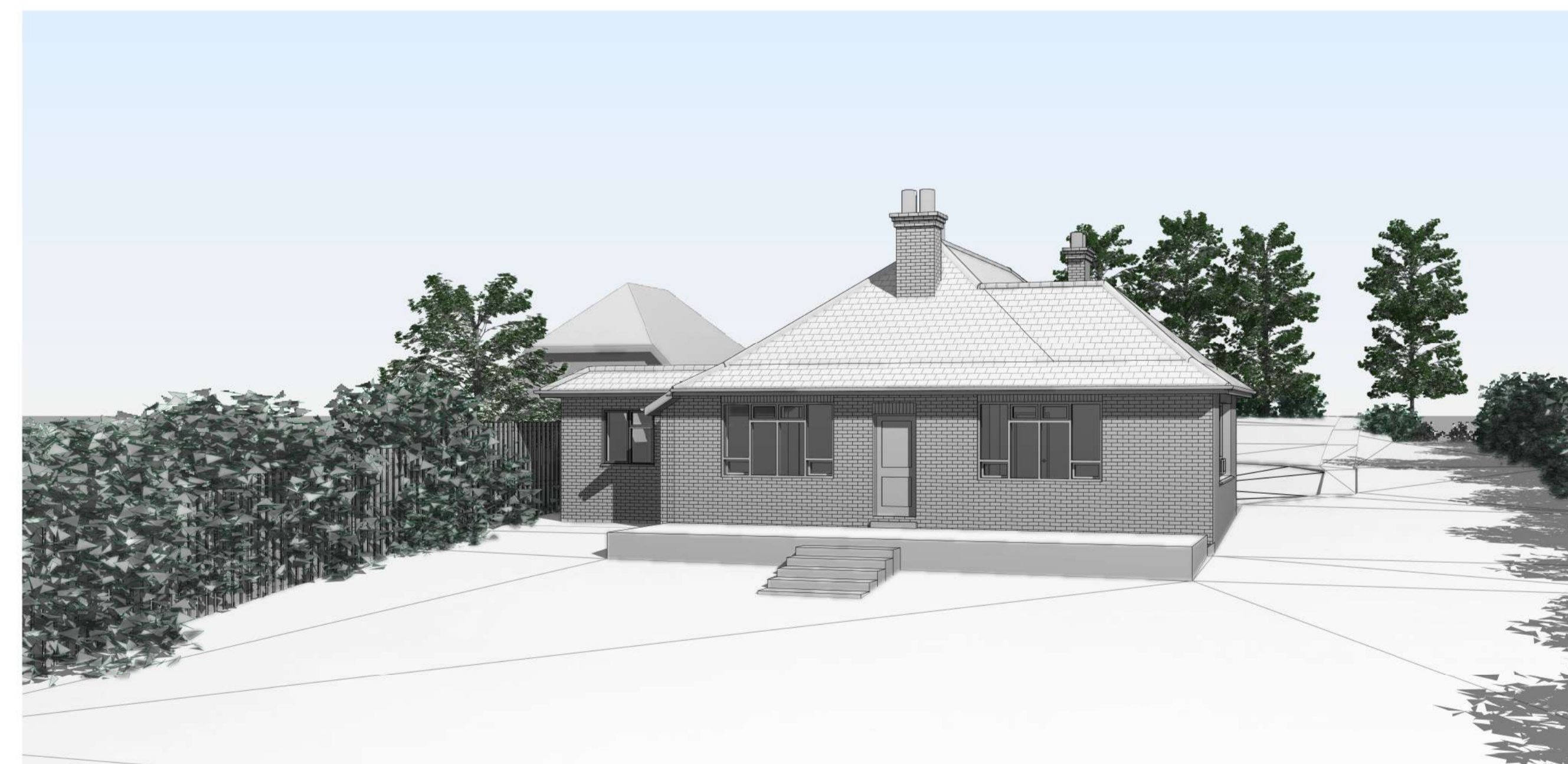
4 Proposed Rear Perspective View