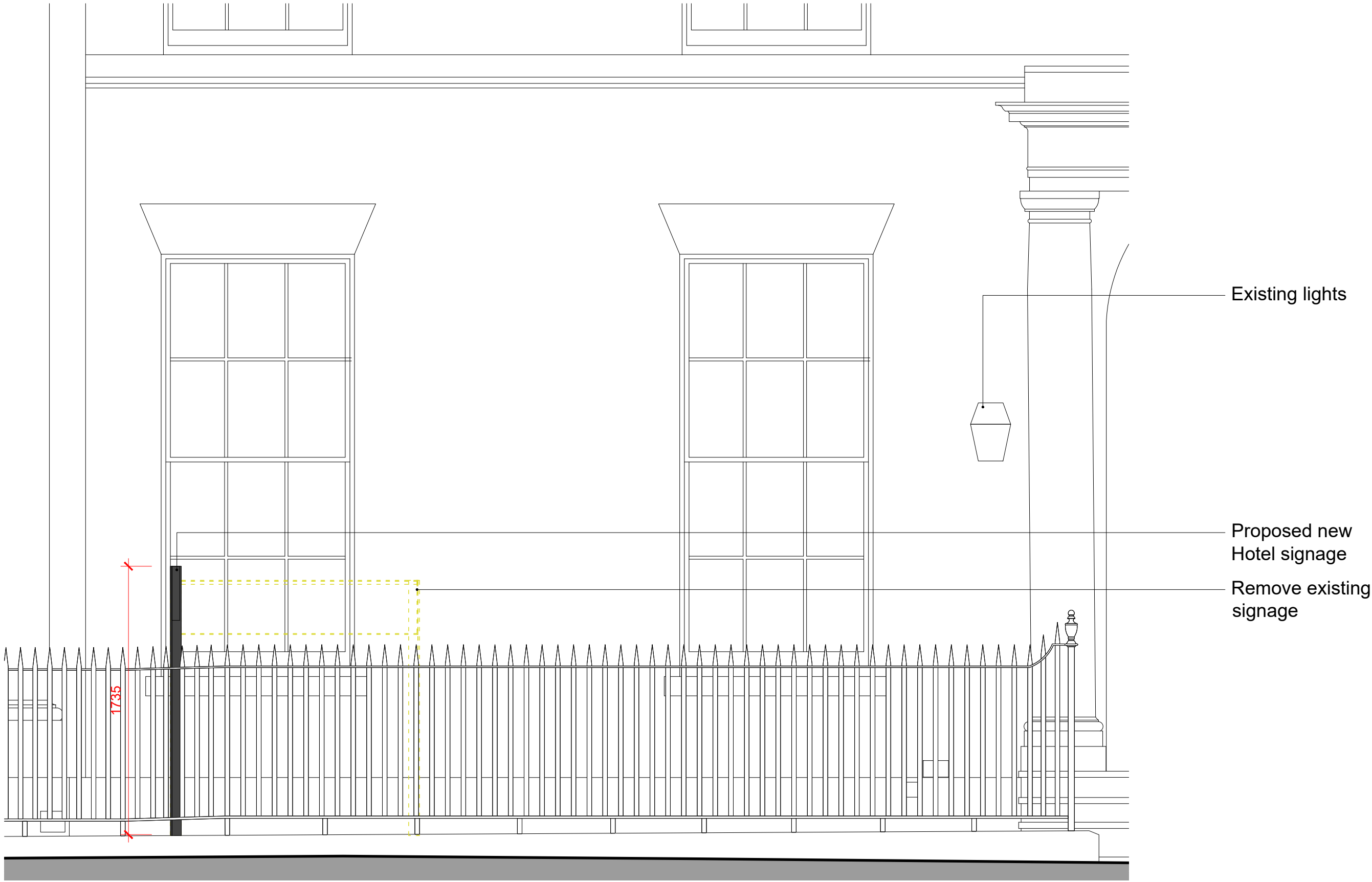
019 02 Proposed Front Elevation Scale 1:25 @ A2