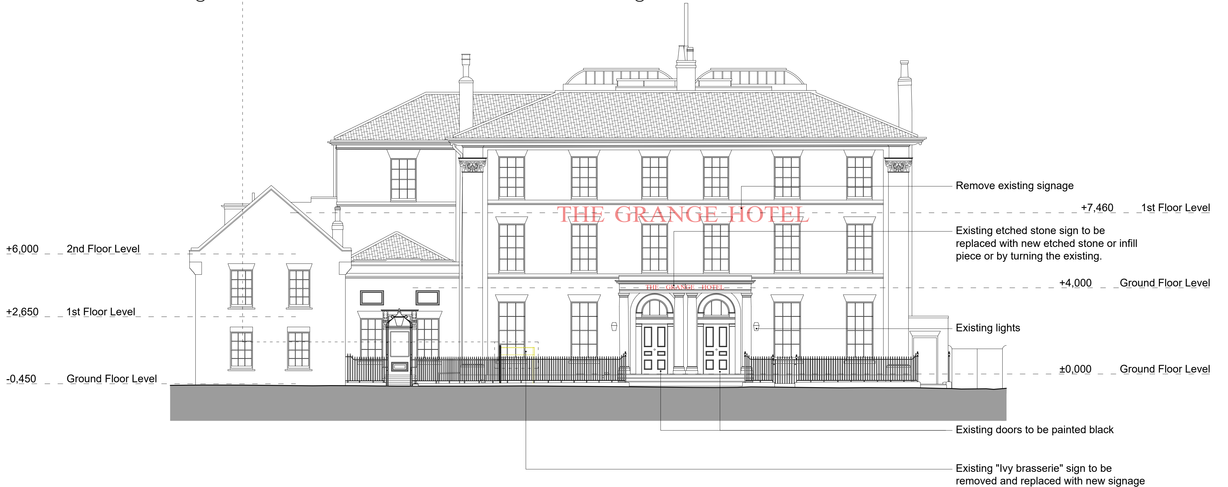
015 01 Proposed Front Elevation Scale 1:100 @ A2