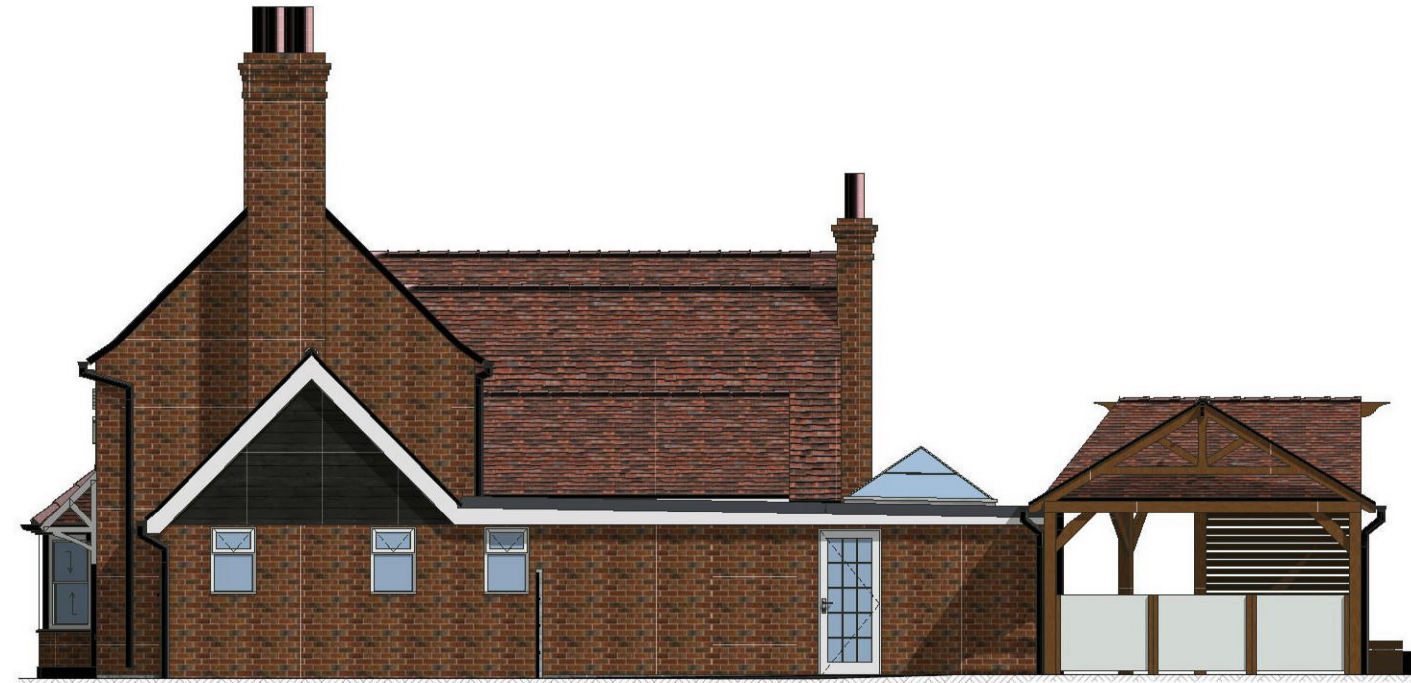
PROPOSED ELEVATION 4