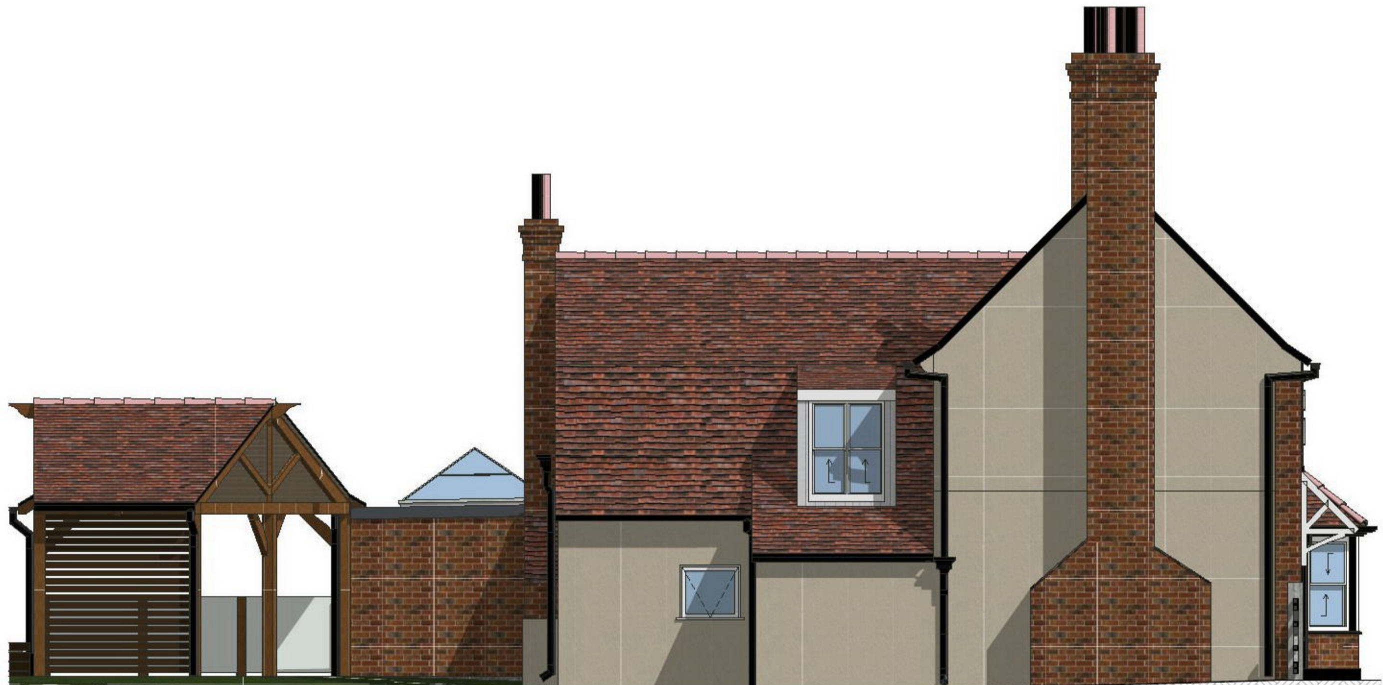
PROPOSED ELEVATION 2