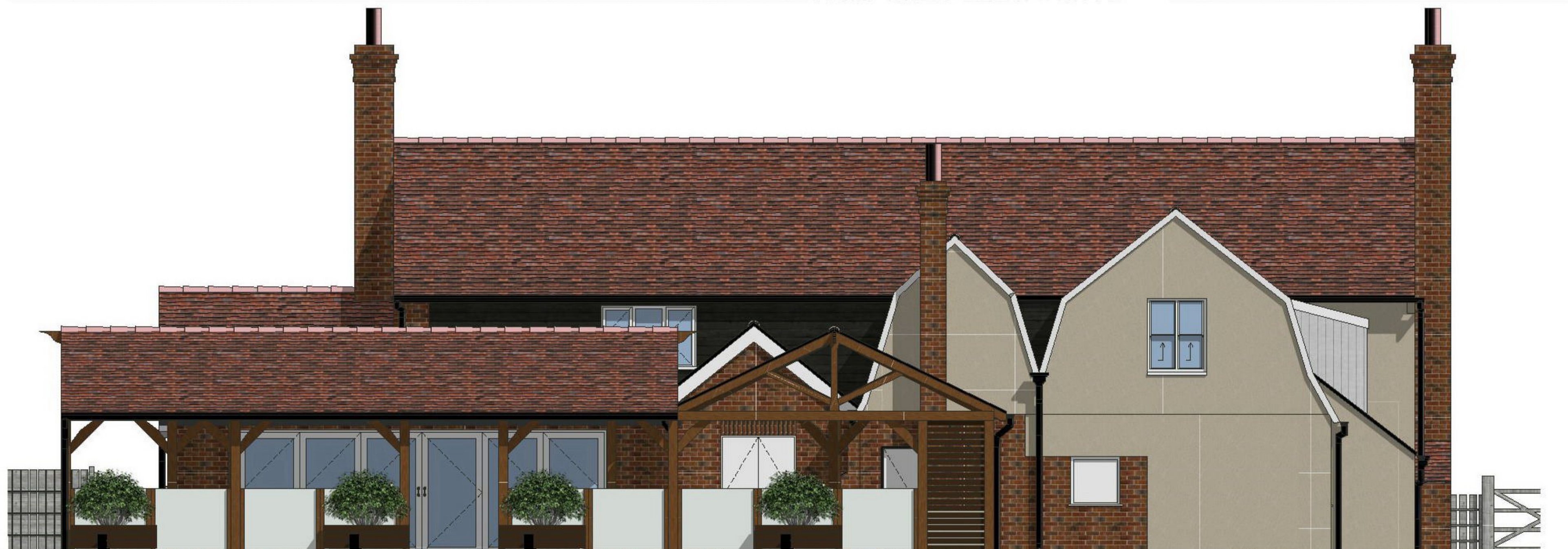
PROPOSED ELEVATION 3