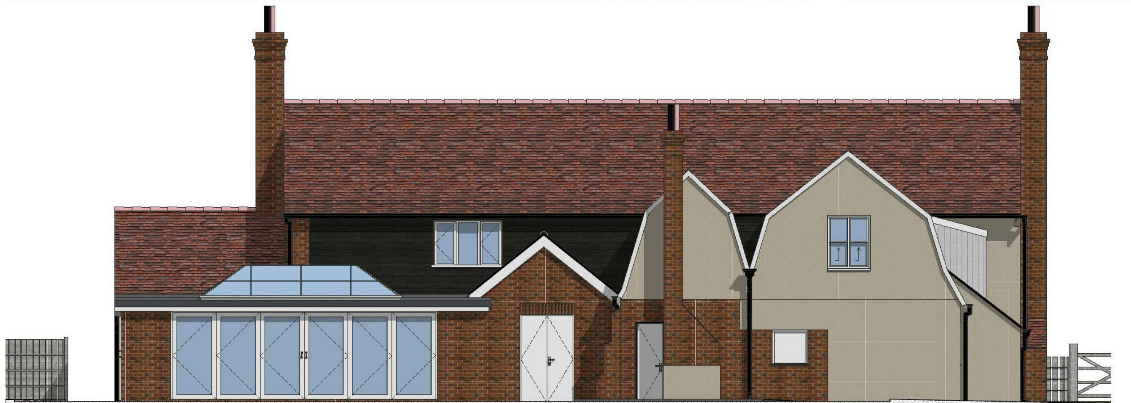
EXISTING ELEVATION 3