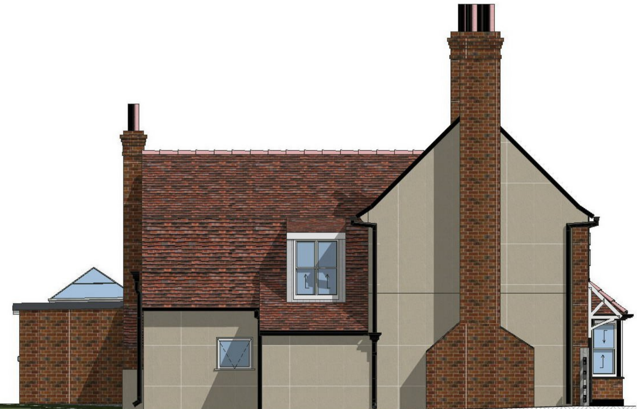
EXISTING ELEVATION 2