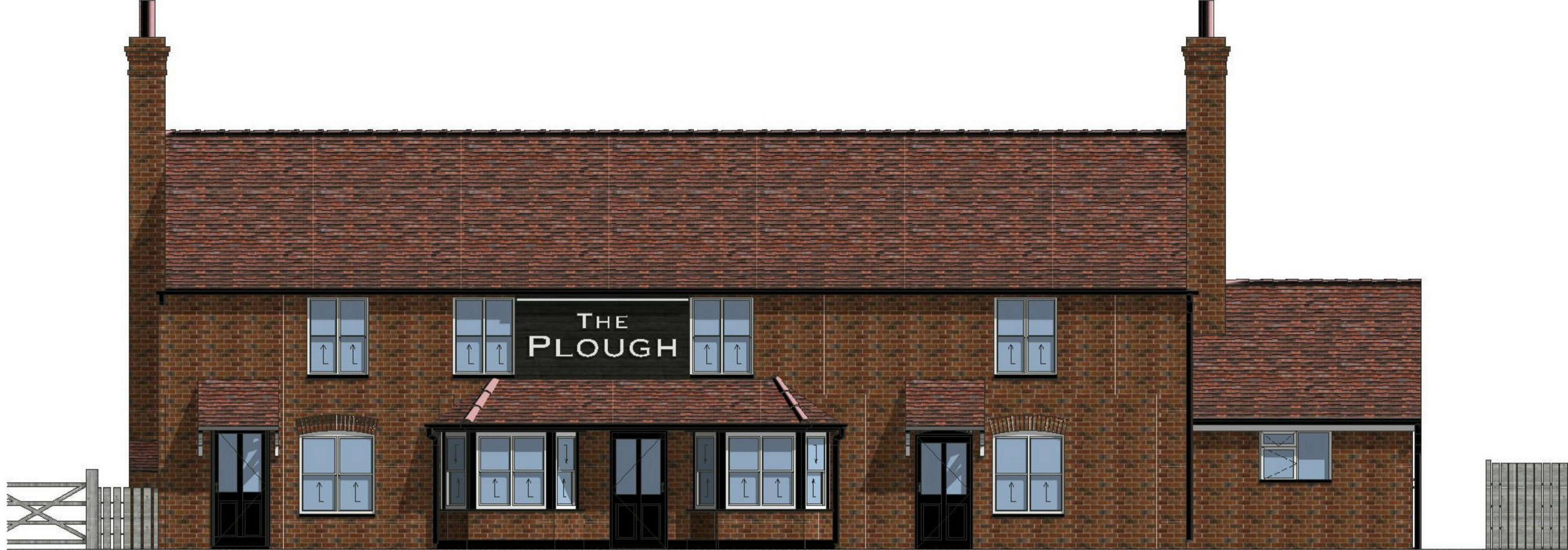
EXISTING ELEVATION 1