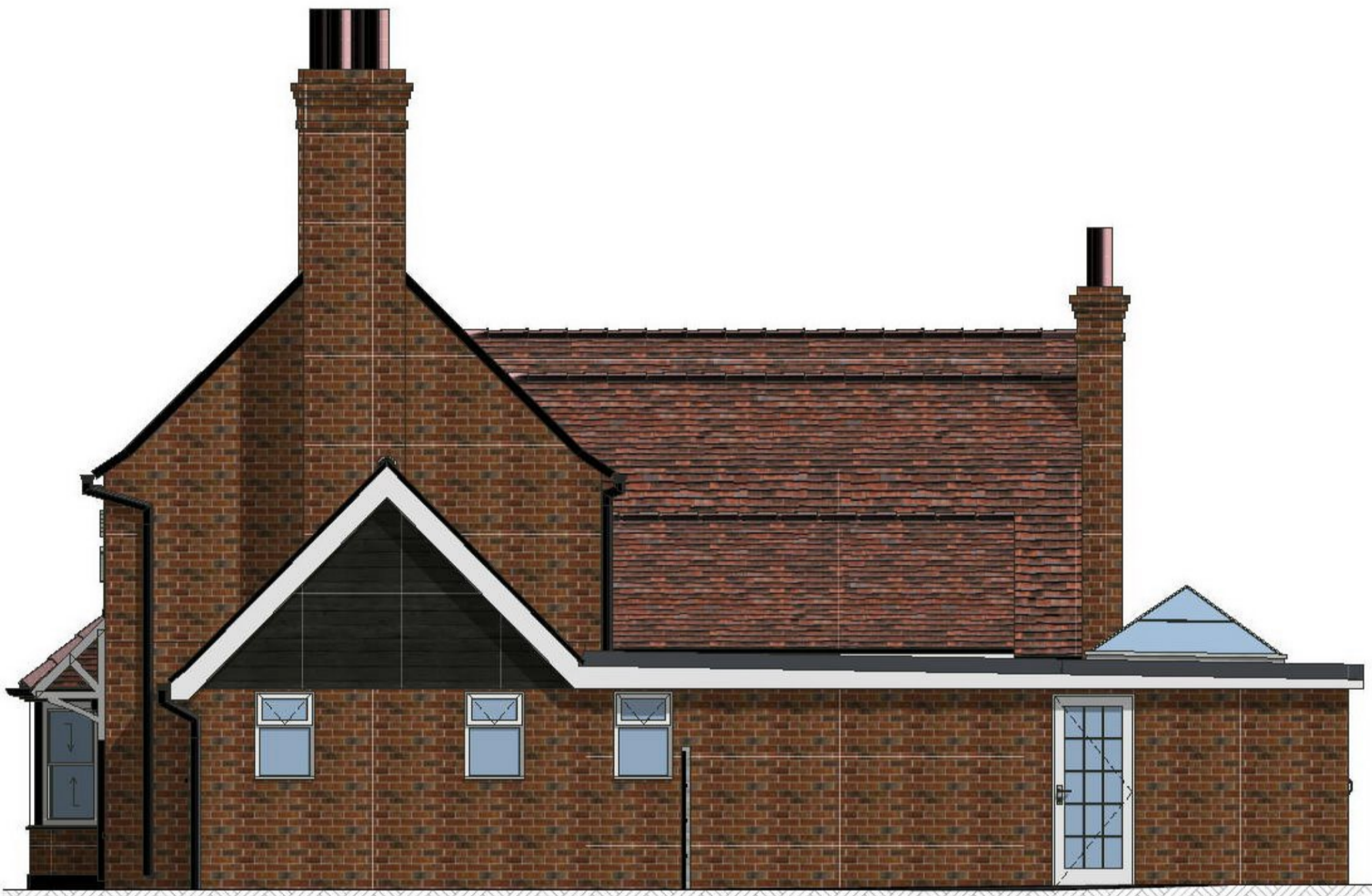
EXISTING ELEVATION 4