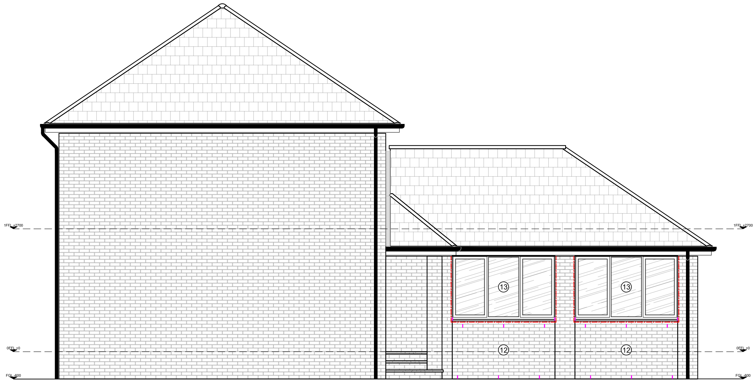
Side Elevation PROPOSED 1:50