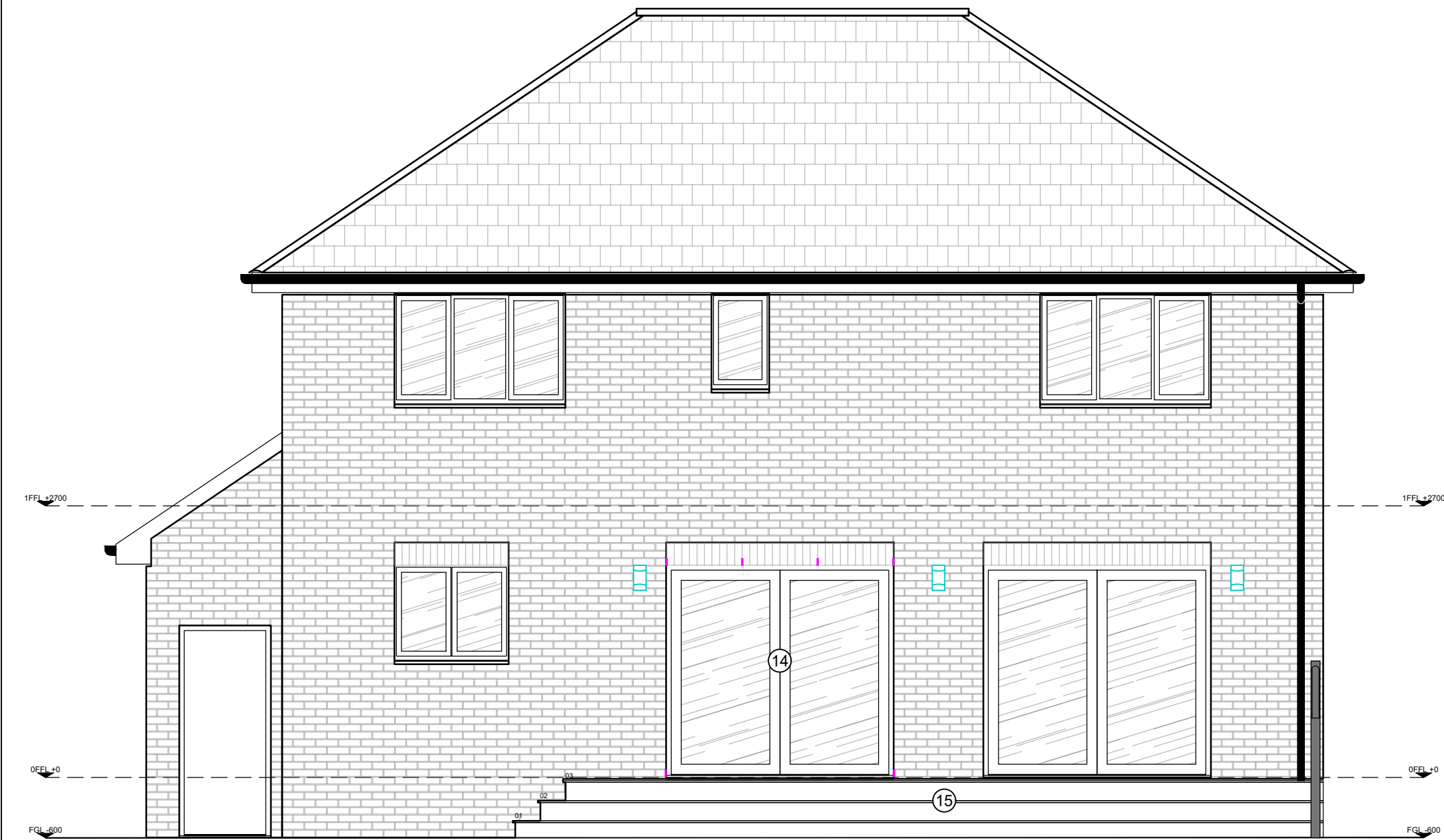
Rear Elevation PROPOSED 1:50