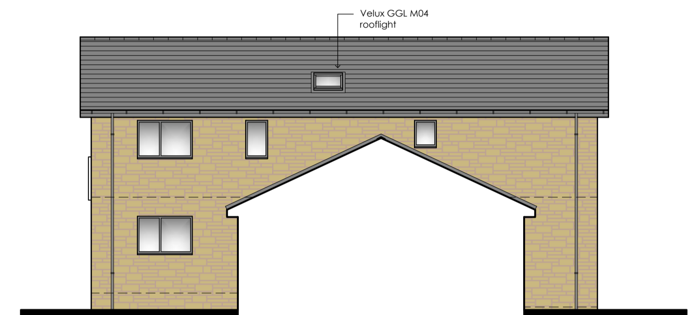
SIDE (NORTH WEST) ELEVATION (SHOWING EXTENSION)