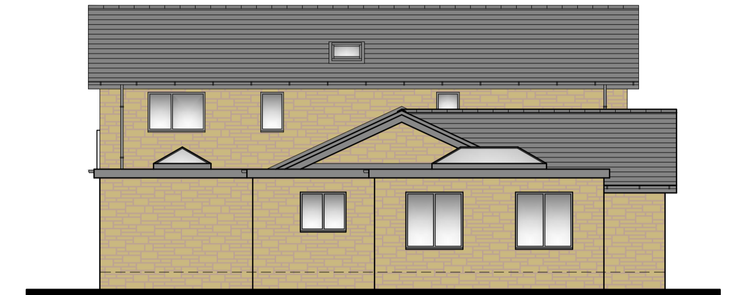
SIDE (NORTH WEST) ELEVATION (FULL ELEVATION)