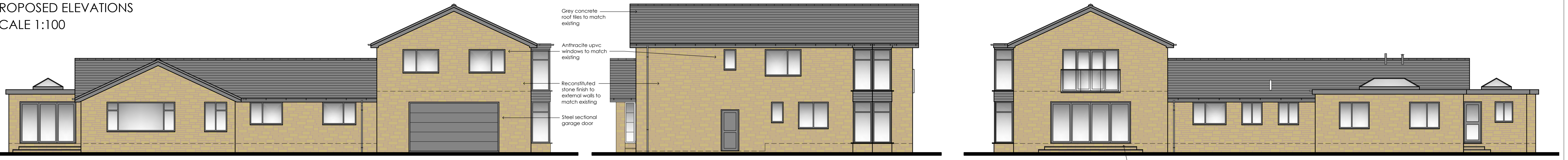
FRONT (SOUTH WEST) ELEVATION