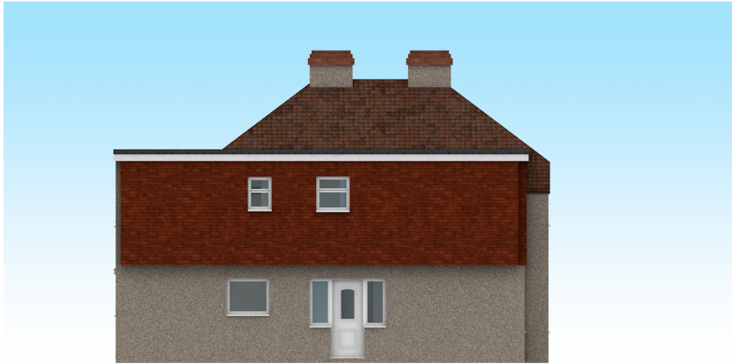
3 Side Elevation (Left)