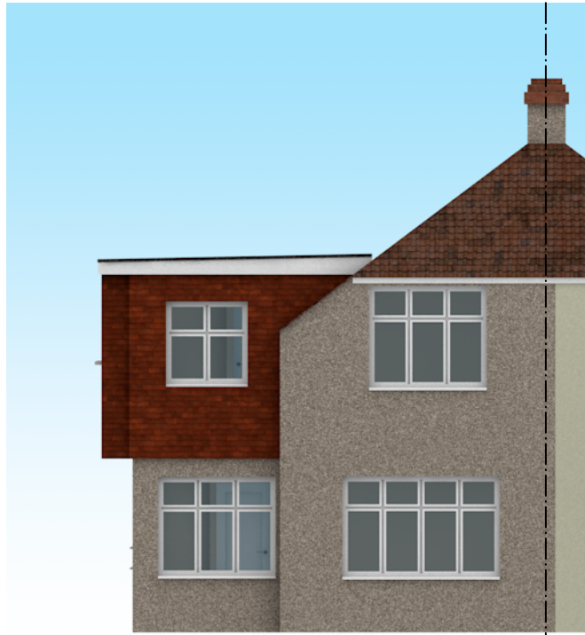
1 Front Elevation