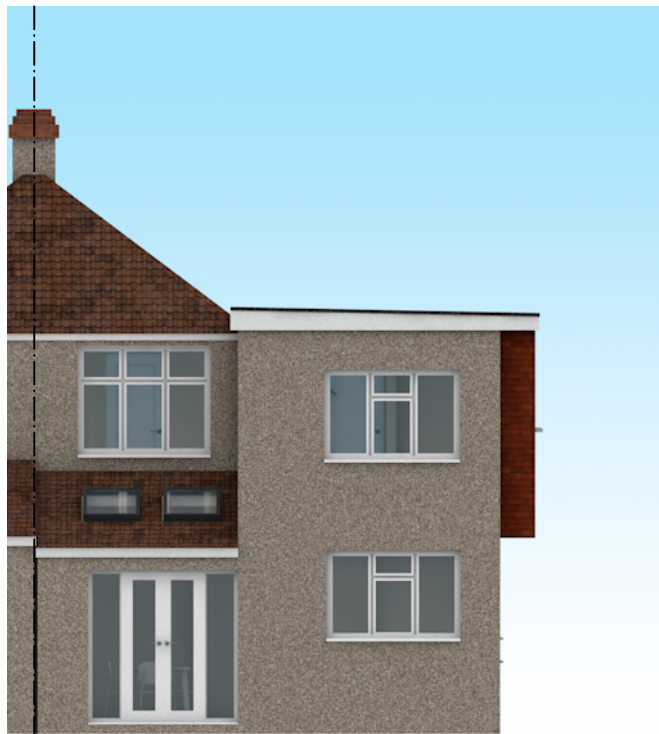
2 Rear Elevation