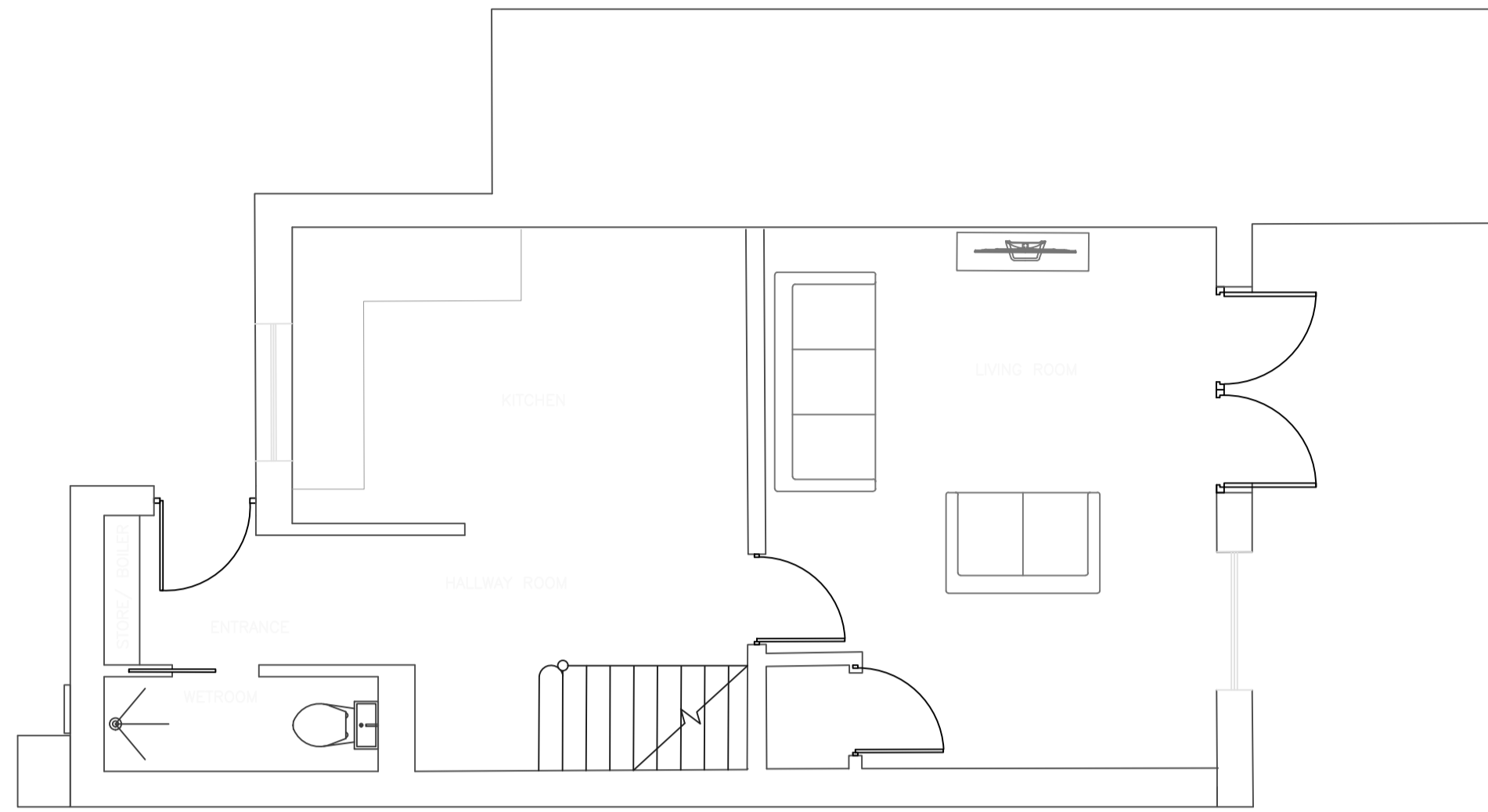
01 - FLOOR PLAN

NOTES: THIS DRAWING, IDEAS AND CONCEPTS ARE COPYRIGHT OF THE JOHNSON AND JOHNSON DESIGN PARTNERSHIP LTD AND NOT TO BE REPRODUCED EXCEPT BY WRITTEN PERMISSION. ALL DIMENSIONS TO BE CHECKED ON SITE AND ANY DISCREPANCIES AND ADJUSTMENTS TO BE NOTED AND PASSED TO THE CA FOR FURTHER INSTRUCTIONS. DO NOT SCALE DRAWING, IF IN DOUBT ASK.