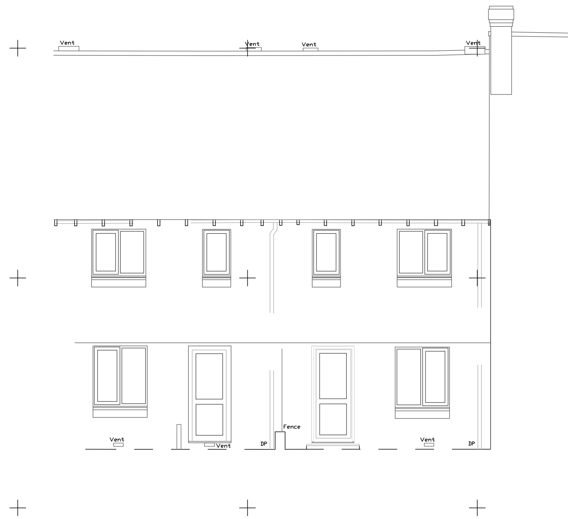
02 - ELEVATION