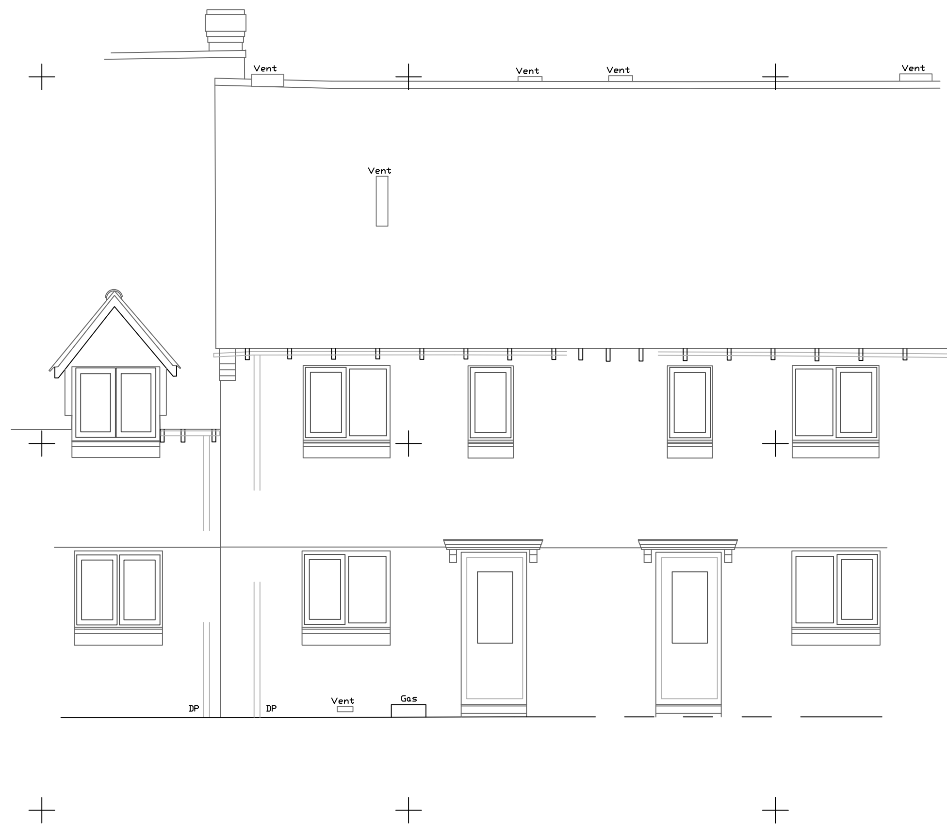
01 - ELEVATION

NOTES: THIS DRAWING, IDEAS AND CONCEPTS ARE COPYRIGHT OF THE JOHNSON AND JOHNSON DESIGN PARTNERSHIP LTD AND NOT TO BE REPRODUCED EXCEPT BY WRITTEN PERMISSION. ALL DIMENSIONS TO BE CHECKED ON SITE AND ANY DISCREPANCIES AND ADJUSTMENTS TO BE NOTED AND PASSES TO THE CA FOR FURTHER INSTRUCTIONS. DO NOT SCALE DRAWING, IF IN DOUBT ASK.