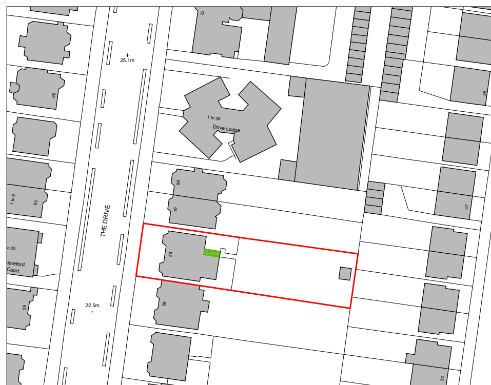
Site Location Plan @ 1:1250 Scale