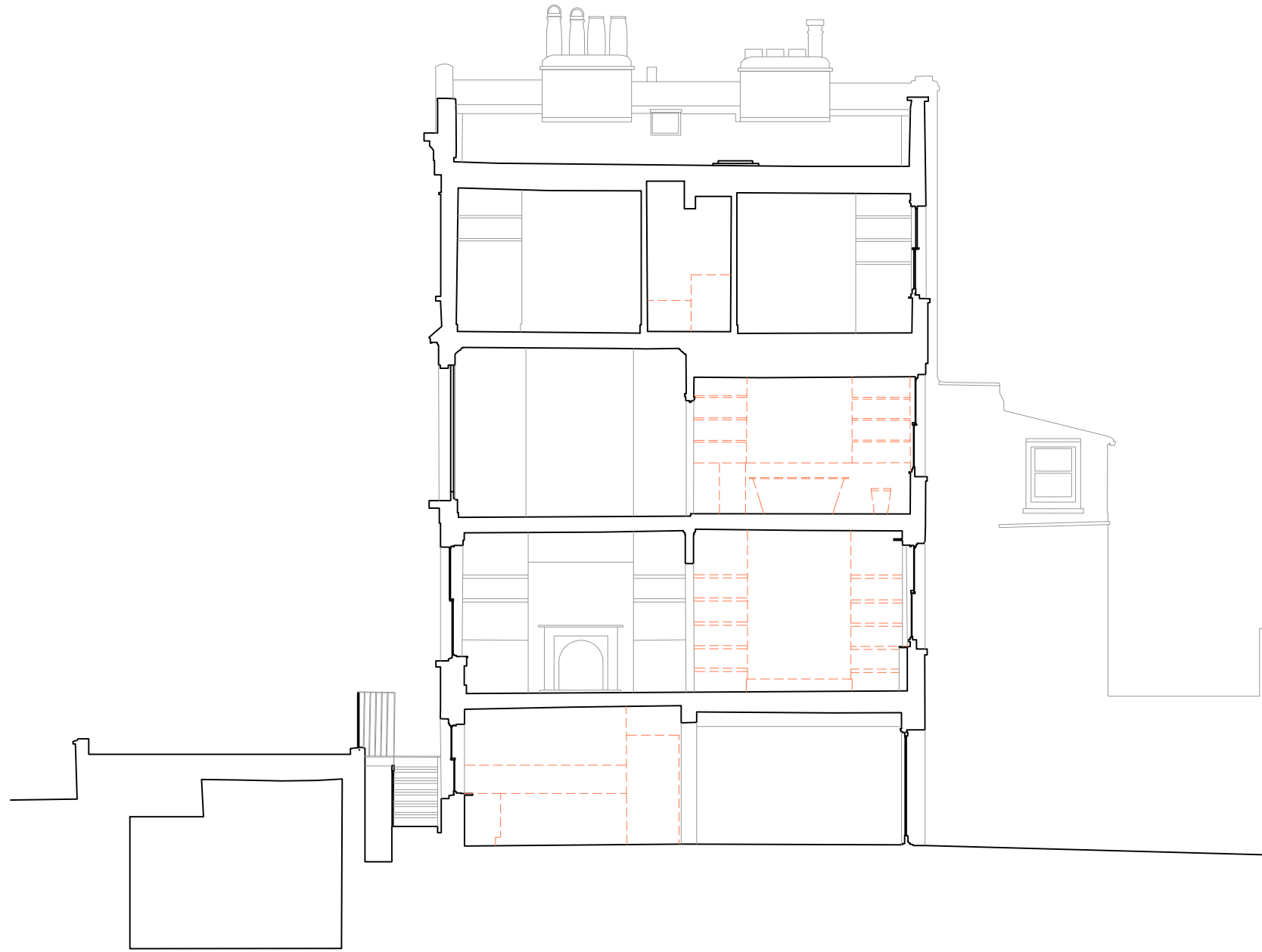
Demolition Section AA Scale 1:100 @ A3