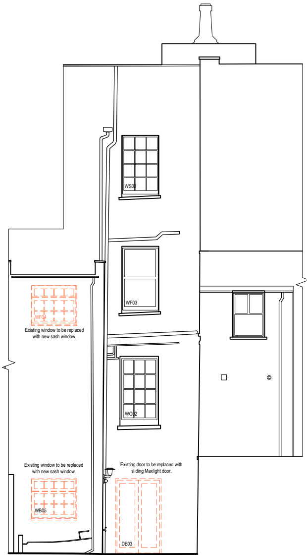
Demolition South East Elevation (Rear) Scale 1:100 @ A3