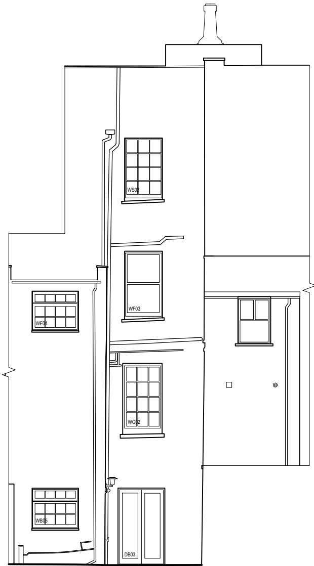
Existing South East Elevation (Rear) Scale 1:100 @ A3