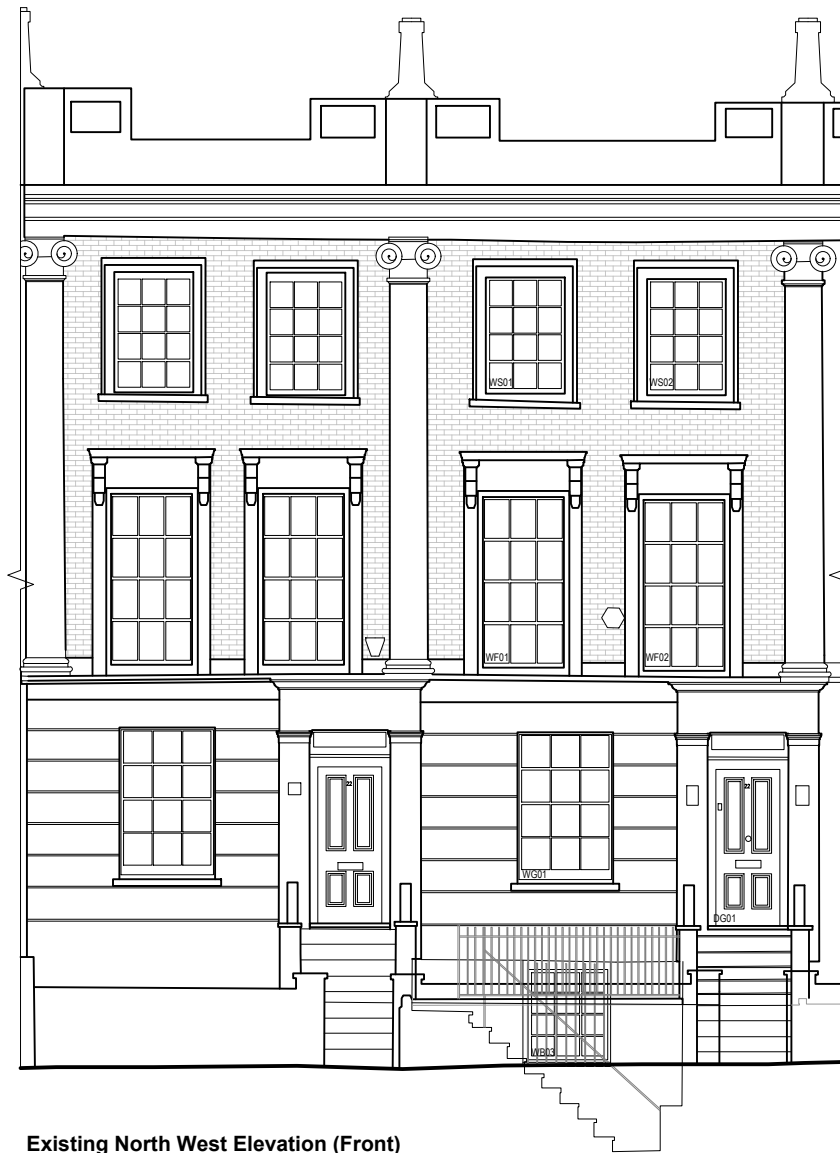
Existing North West Elevation (Front) Scale 1:100 @ A3